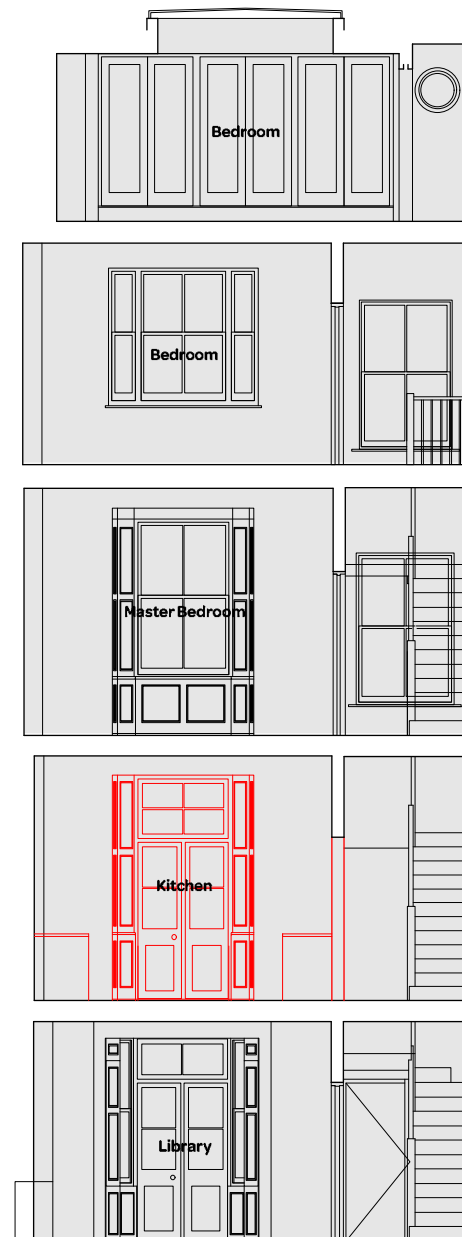
PROPOSED SECTION BB