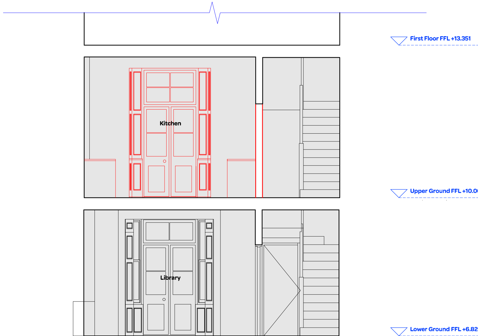
PROPOSED SECTION BB