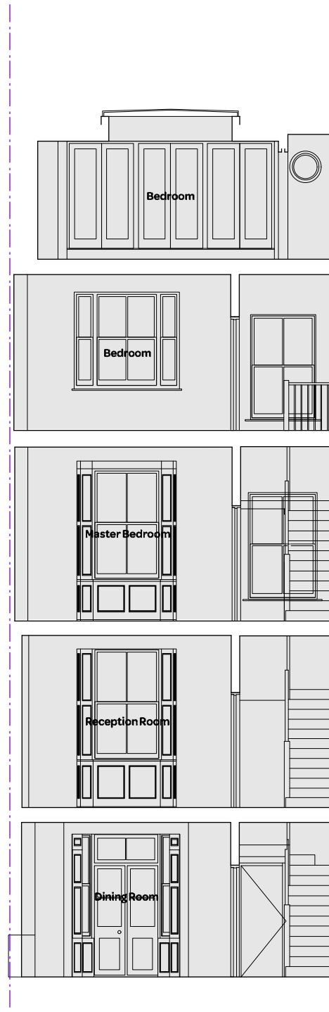
EXISTING SECTION BB