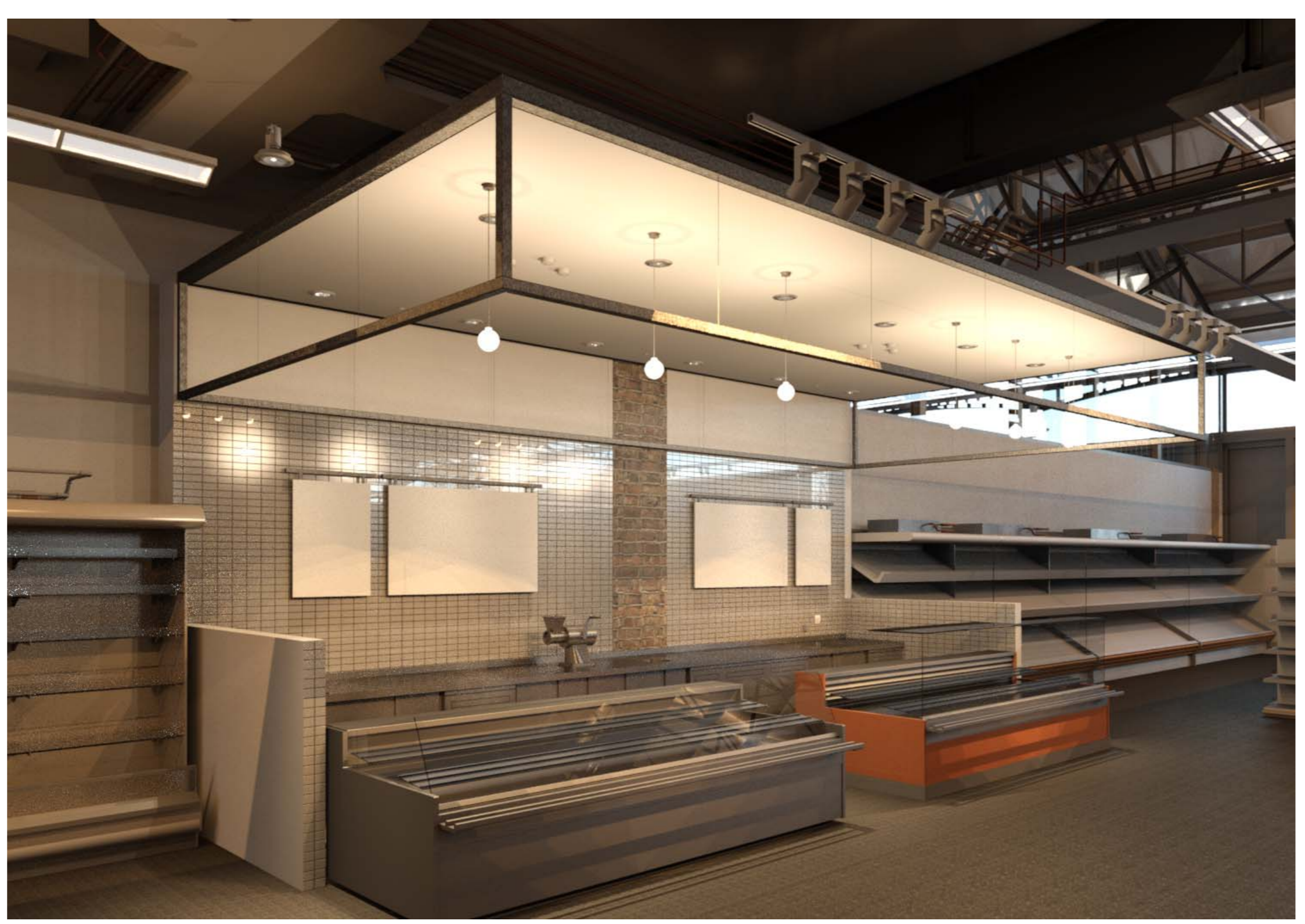
2. MEAT & FINISH RAFT VISUAL (FINISHES AND SERVICES ARE INDICATIVE)