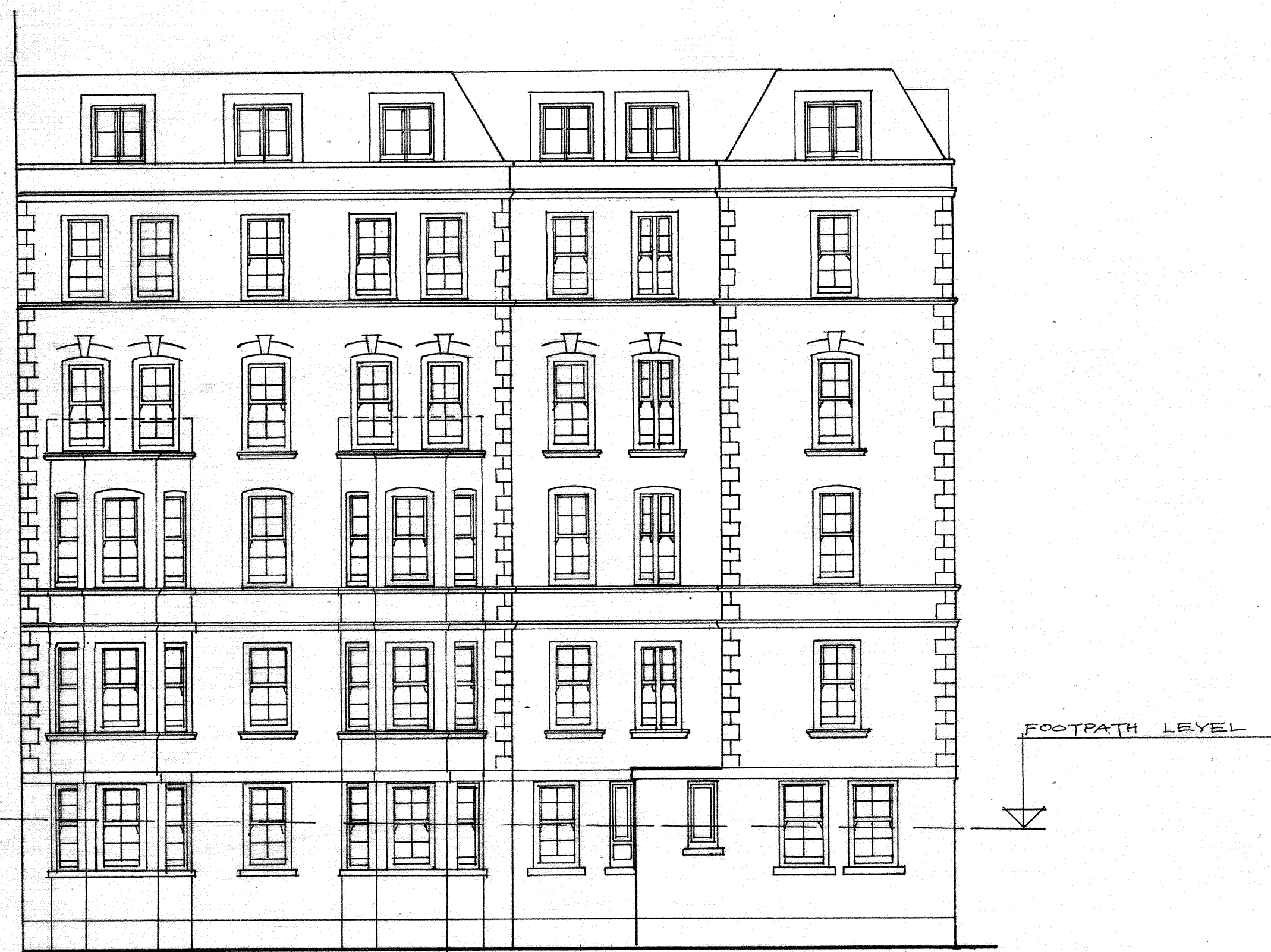
CHENIES STREET ELEVATION 'A'