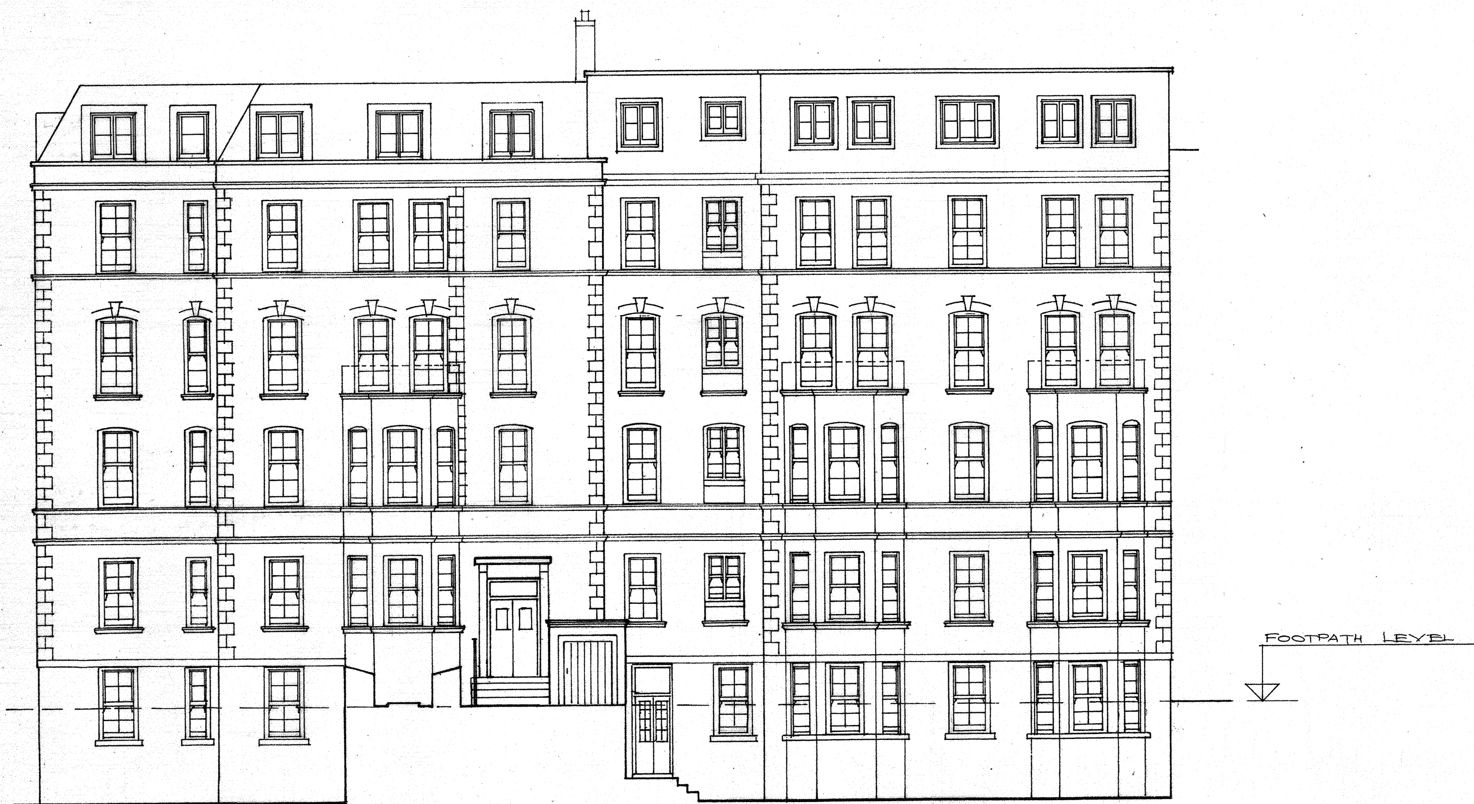
HUNTLEY STREET ELEVATION 'B'

READ IN CONJUNCTION WITH DRAWING NO. 0515/423-04.