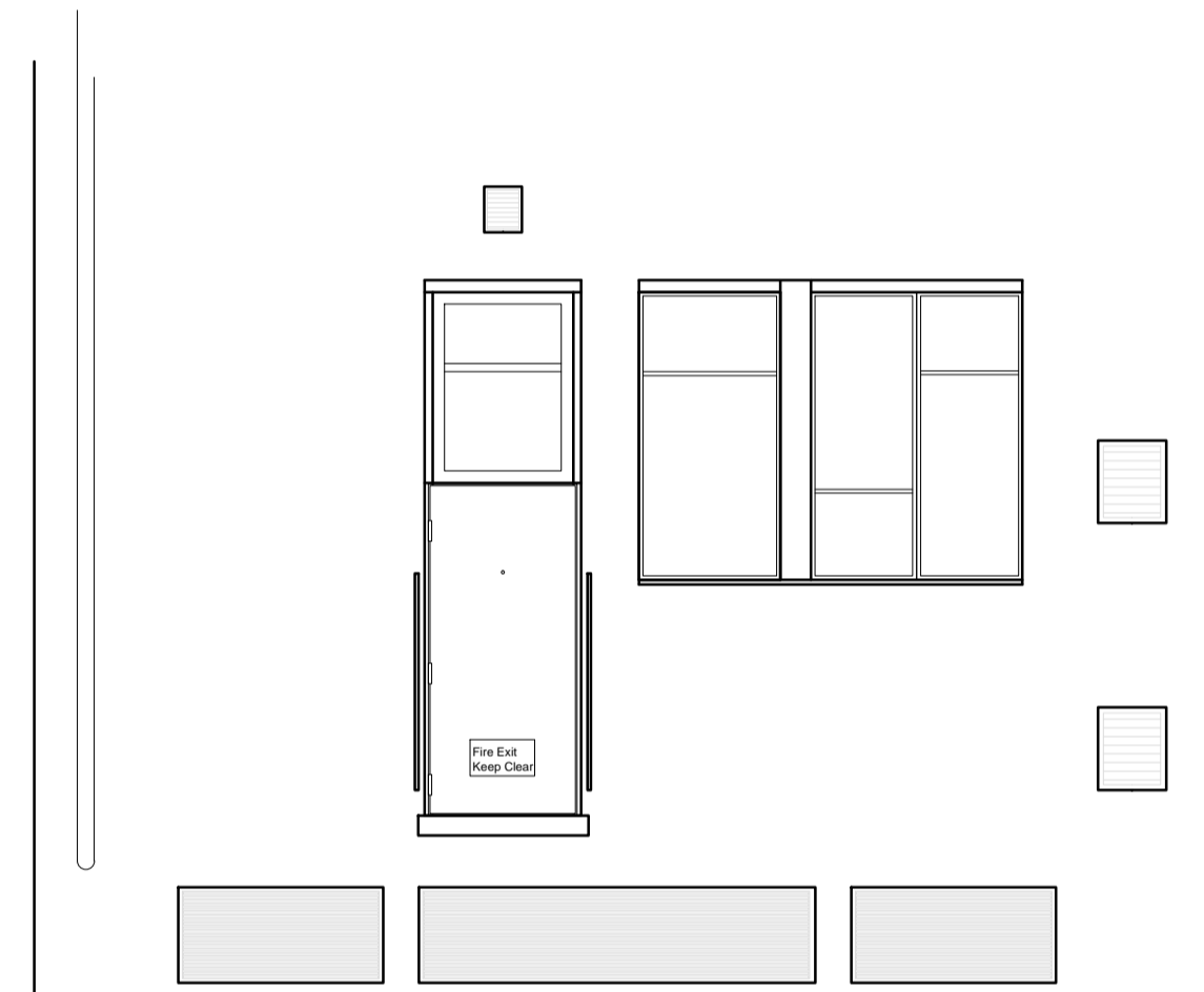
AS PROPOSED SECTION A-A @ 1:50 / A1