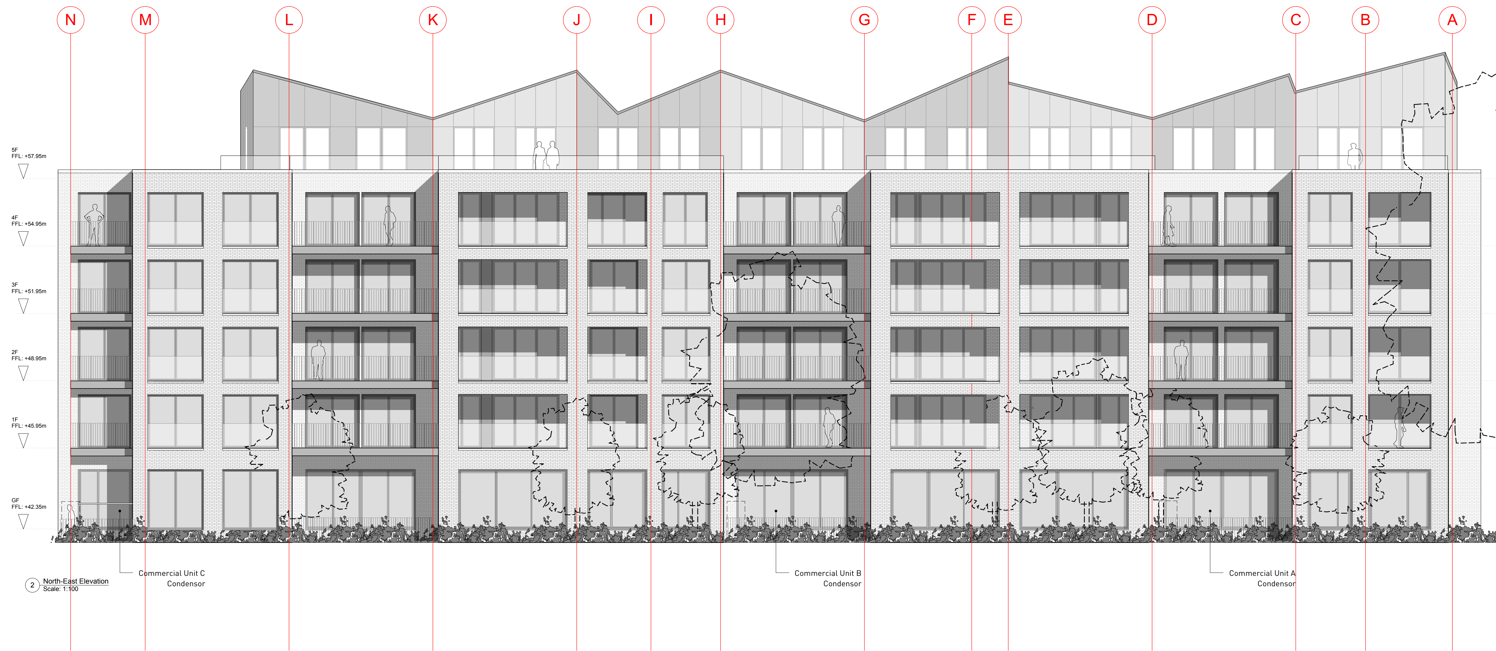
2 North-East Elevation Scale: 1:100