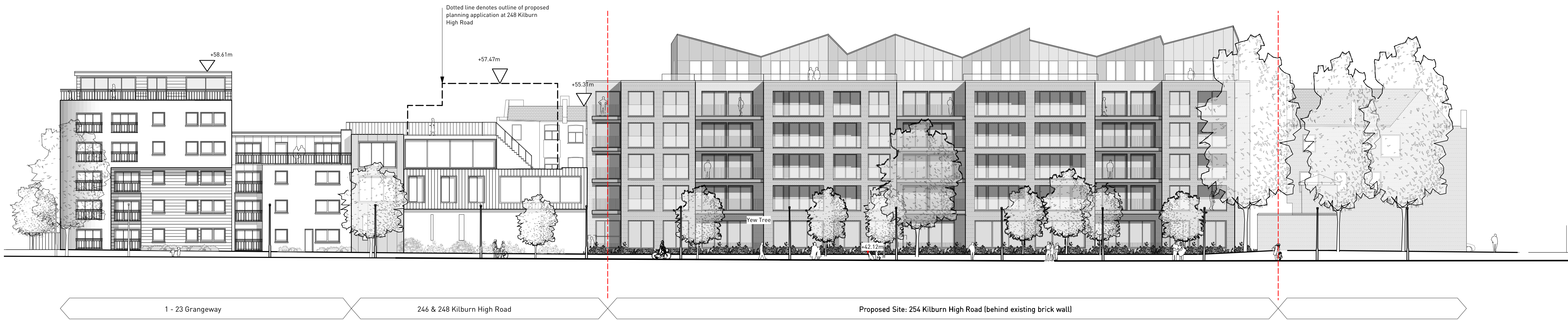
1 North-East Elevation Scale: 1:200