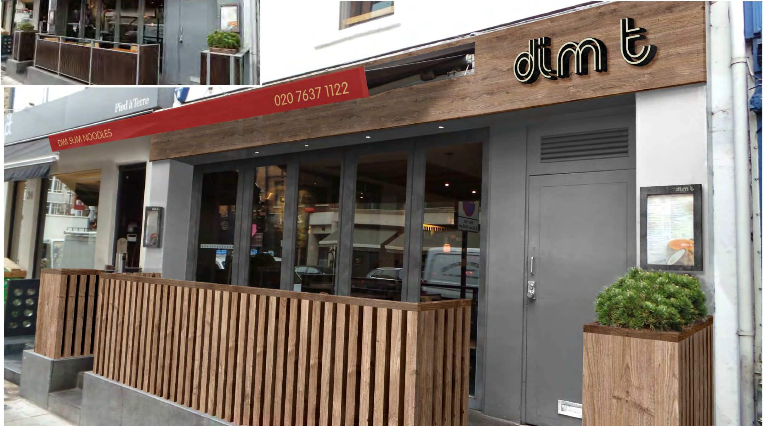
Proposed: Blackened steel open trough letters with warm white LEDS to timber fascia. Blackened steel menu boxes.