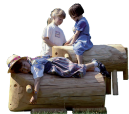
5. Timber animals