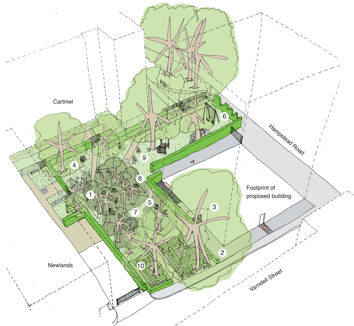
3D view of proposed landscape and public realm

East Architecture landscape urban design