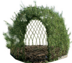
9. Woven willow play structures