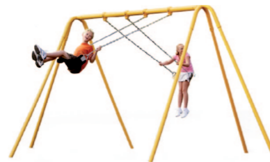
6. High swing