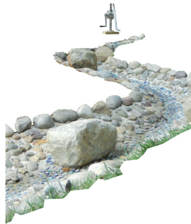
7. Water pump and pebble rill structures