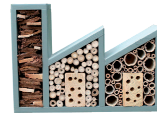
4. Insect hotel