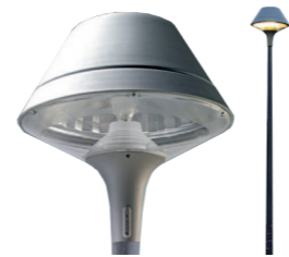
Amenity lighting to pathway