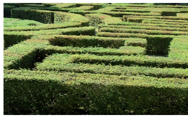
2. Low hedge maze on wood chip mulch