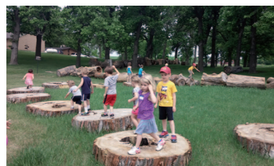
8. Tree trunks and stumps from removed existing trees