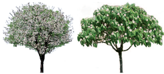
2. Trees: apple and quince trees