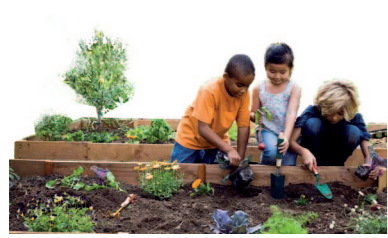
1. Communal planters