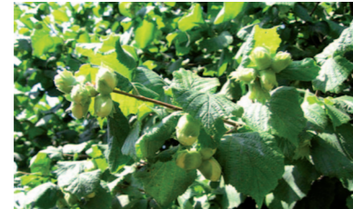
native hedging: hazel