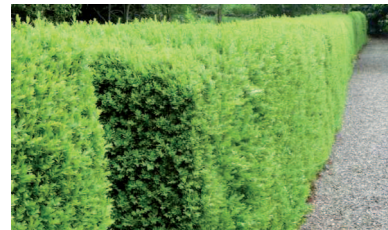
6. double hedge: low hedging: common box