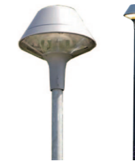
5. Amenity lighting