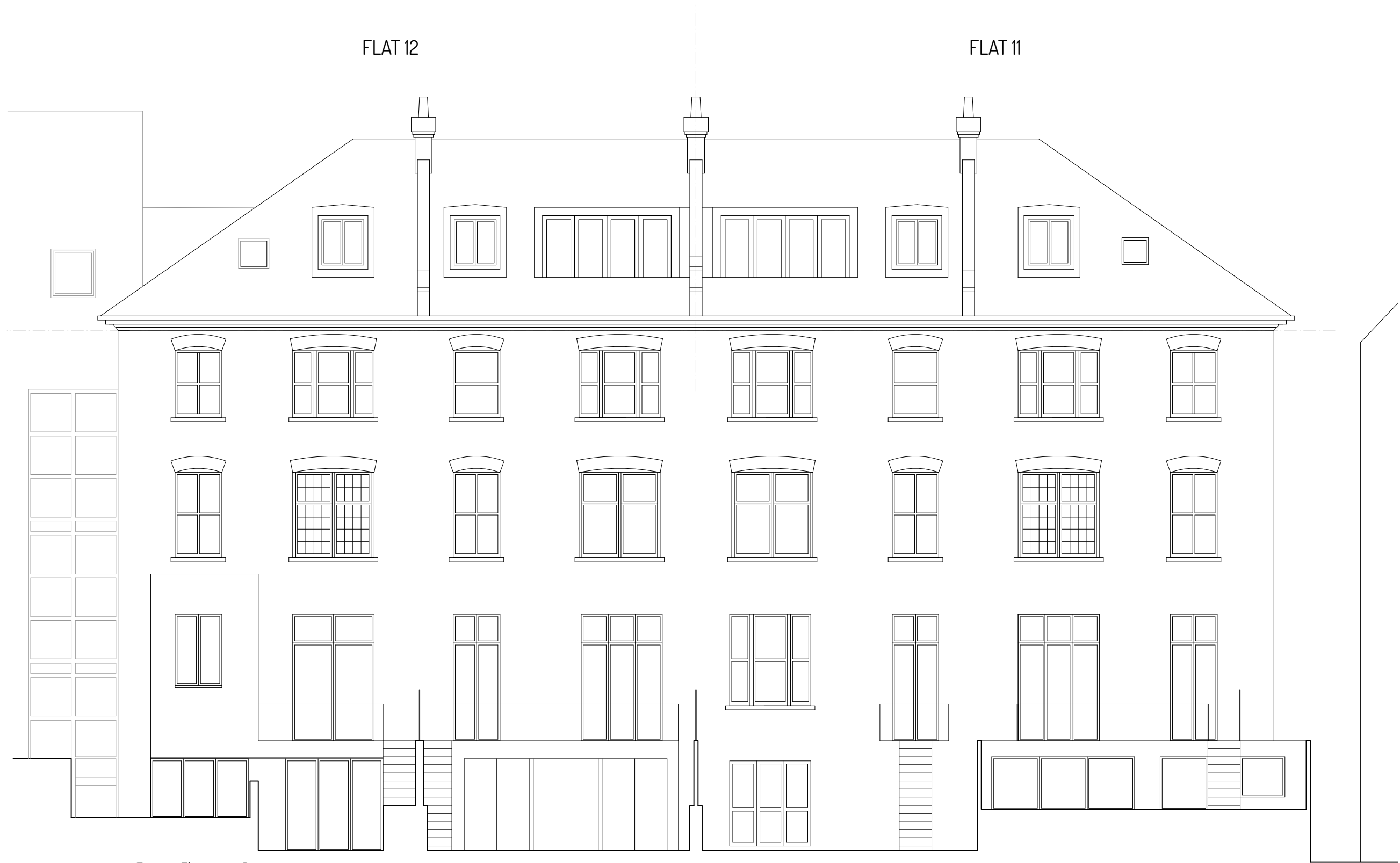
Existing Elevation - Rear