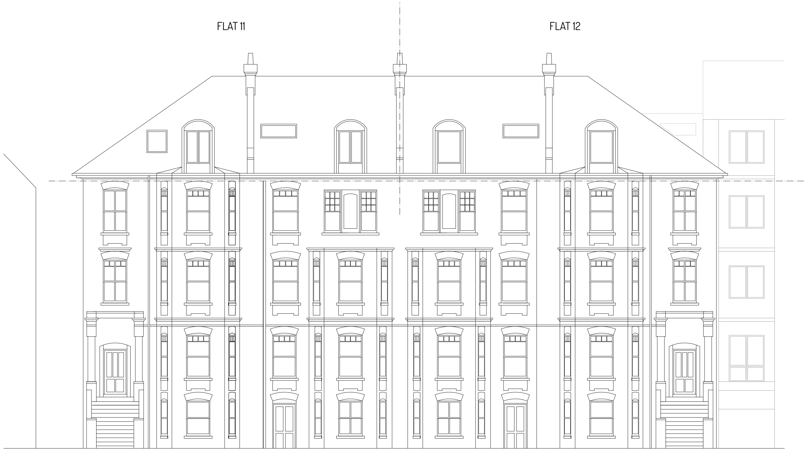
Existing Elevation - Front