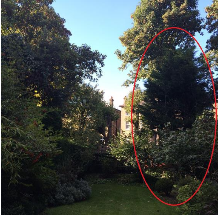
Photograph 1: Rear Garden Looking Northwest