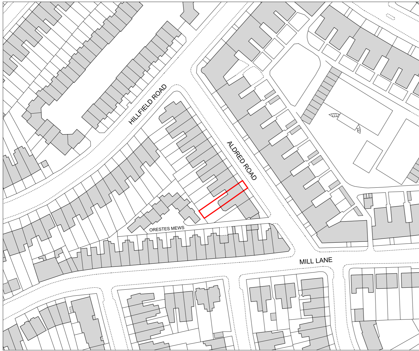
1 PLAN Location Plan