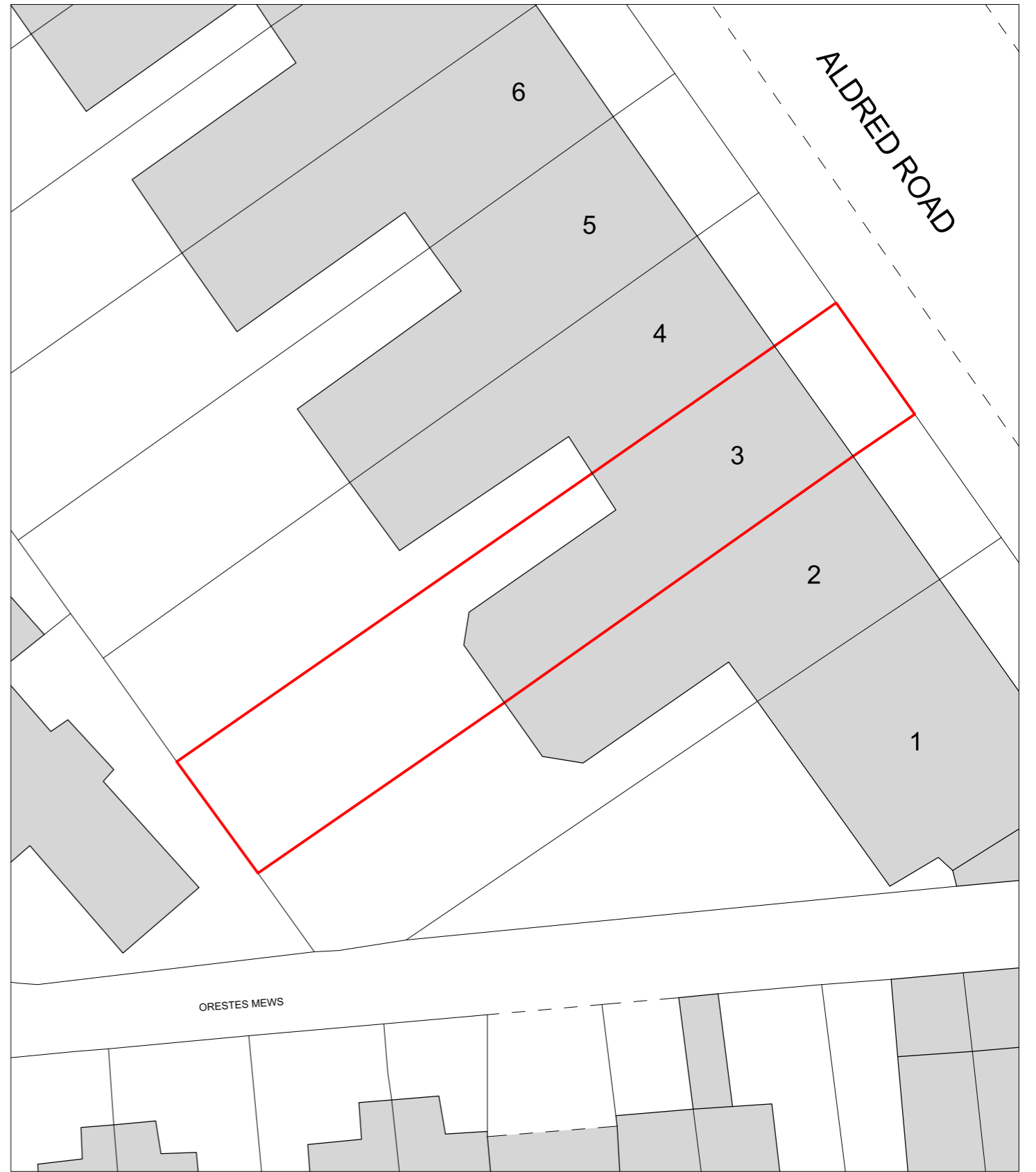
2 PLAN Site Plan