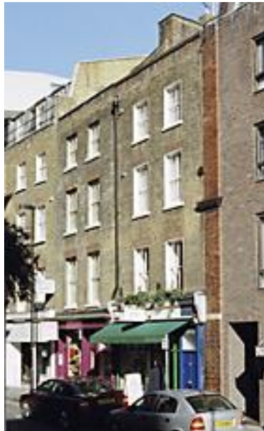
168 Drury Lane London WC2B 5QD