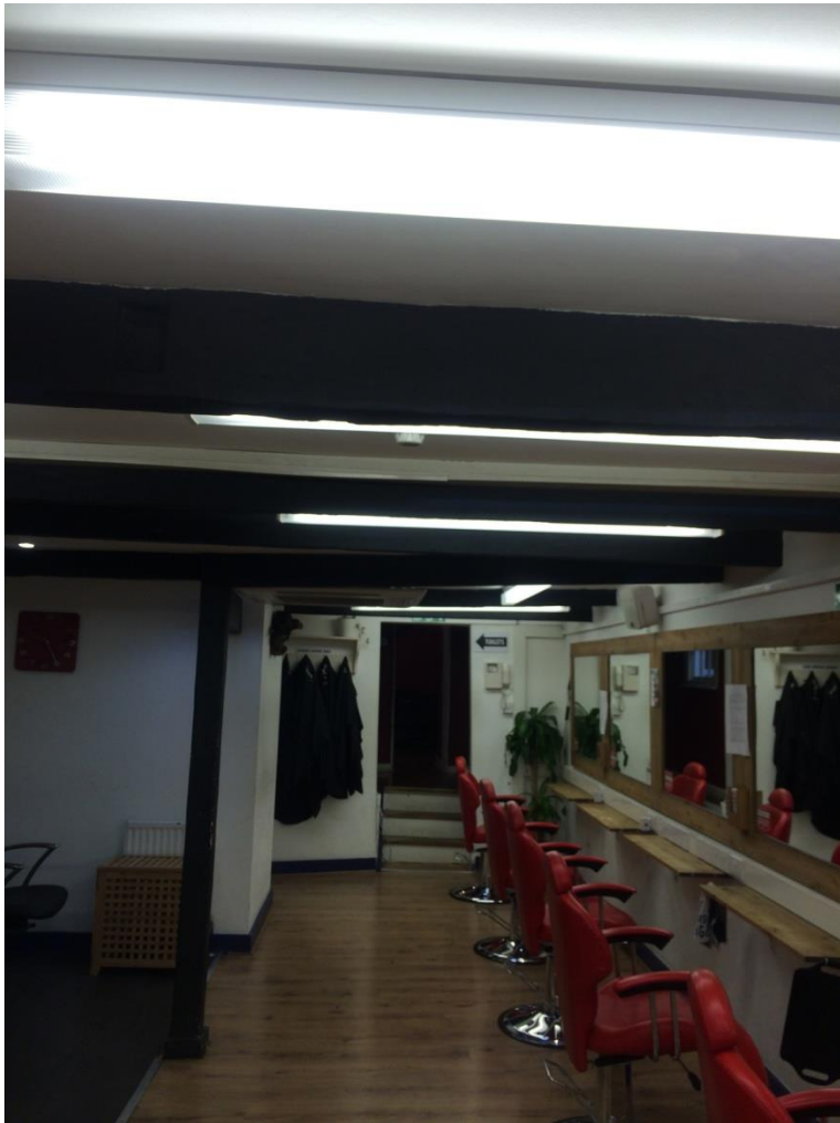
Interior of the 2 storey rear extension (possibly a former stable block) looking west towards principal building. Doorway at the centre leads into the closet wing extension Attached to the rear elevation of the listed building.