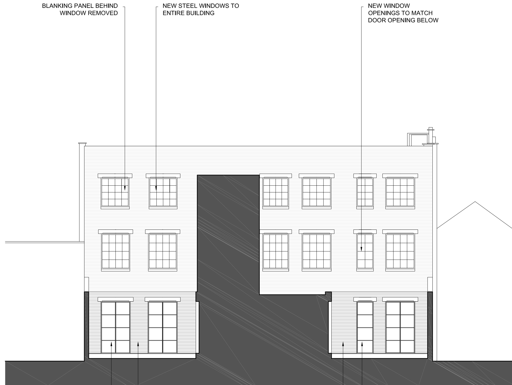
02 REAR ELEVATION 1.100