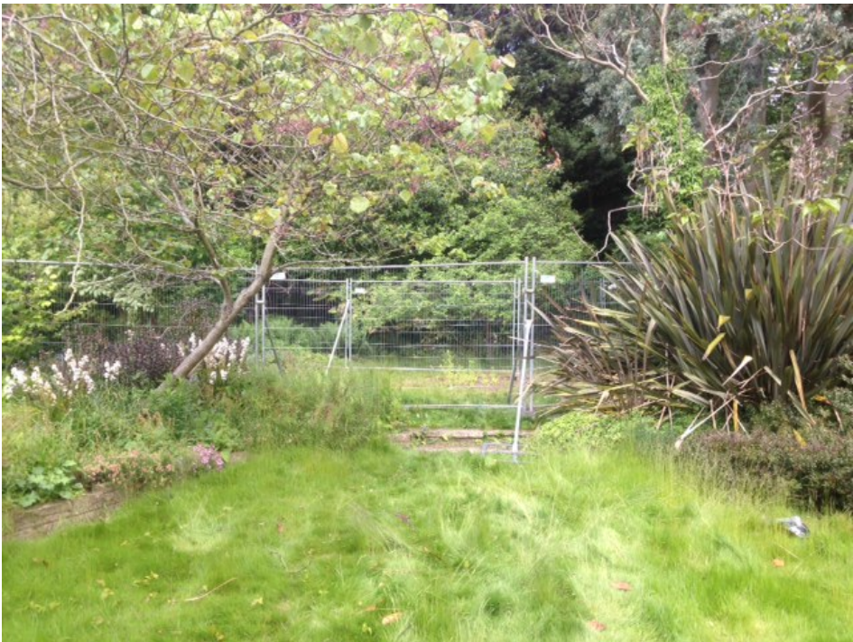
EVIDENCE THAT TREE PROTECTION A IN PLACE