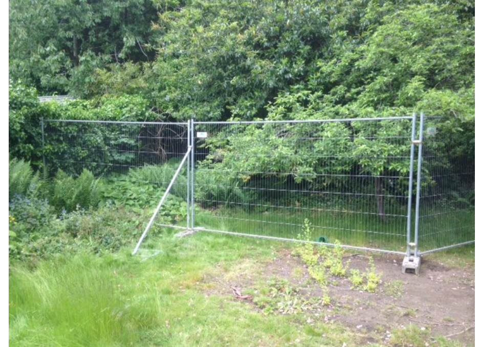
EVIDENCE THAT TREE PROTECTION B IN PLACE