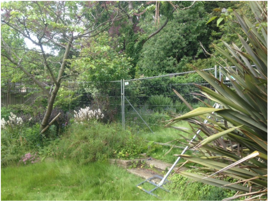
EVIDENCE THAT TREE PROTECTION A IN PLACE