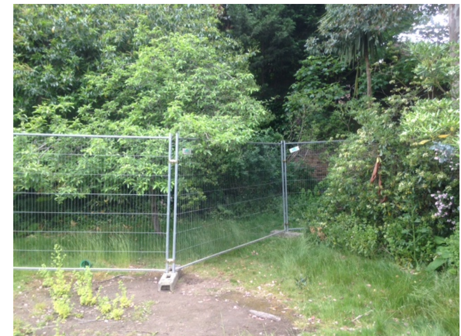
EVIDENCE THAT TREE PROTECTION B IN PLACE