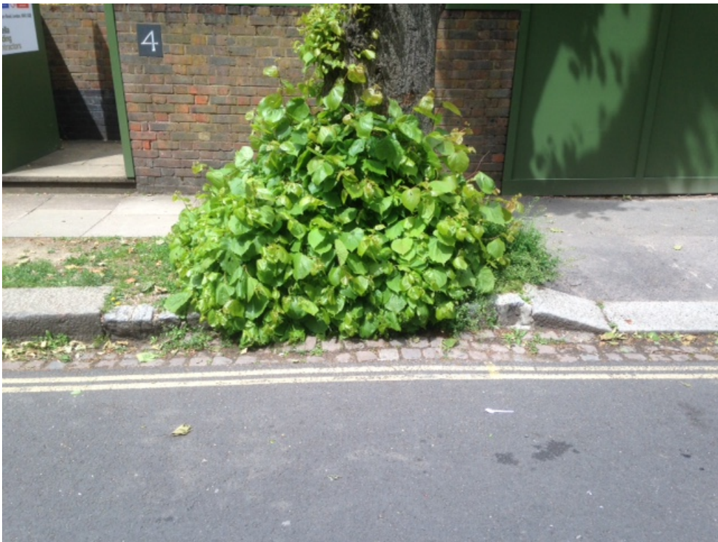
PICTURE OF EXISTING TREE '1'