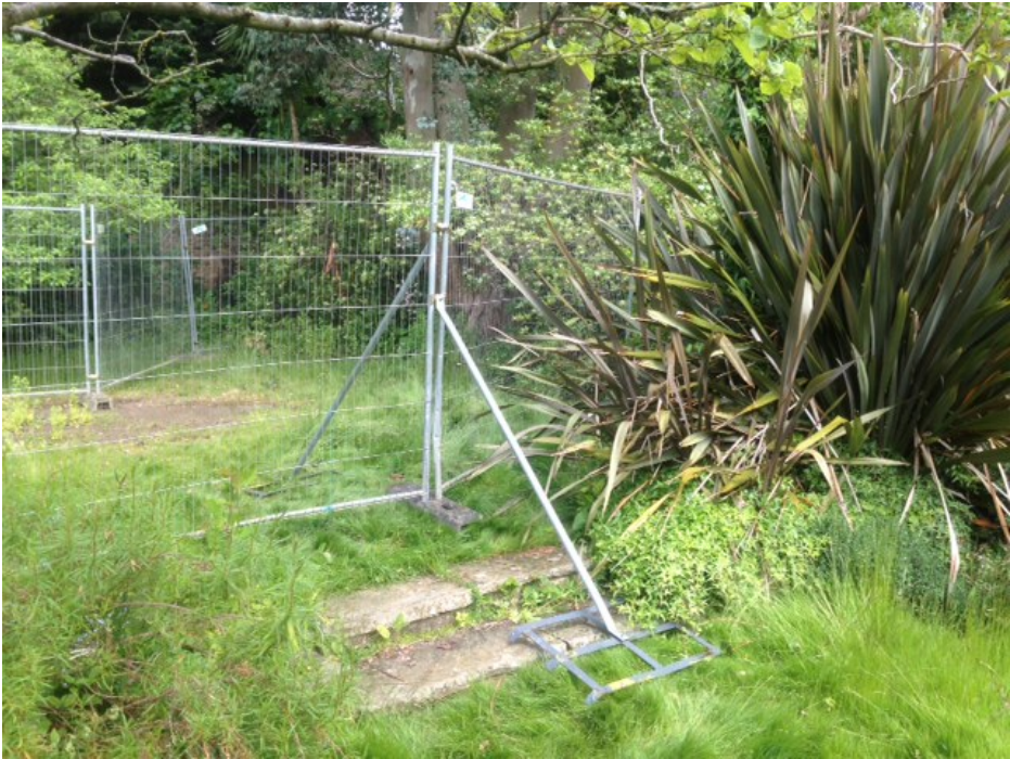
EVIDENCE THAT TREE PROTECTION A IN PLACE