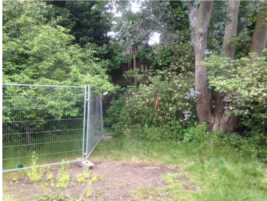
EVIDENCE THAT TREE PROTECTION B IN PLACE