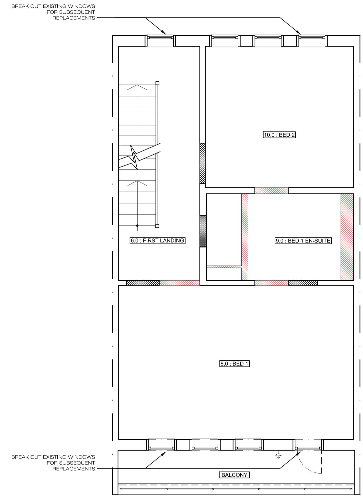
2 FIRST FLOOR PLAN : DEMOLITION Scale 1:50

KEY TO BE DEMOLISHED NEW PARTITIONS/INFILL