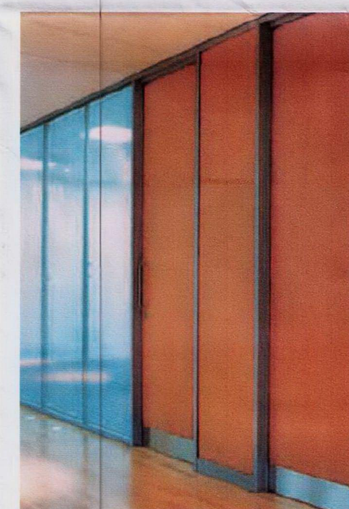
PARTITION SYSTEM REF IMAGES SCALE N/A