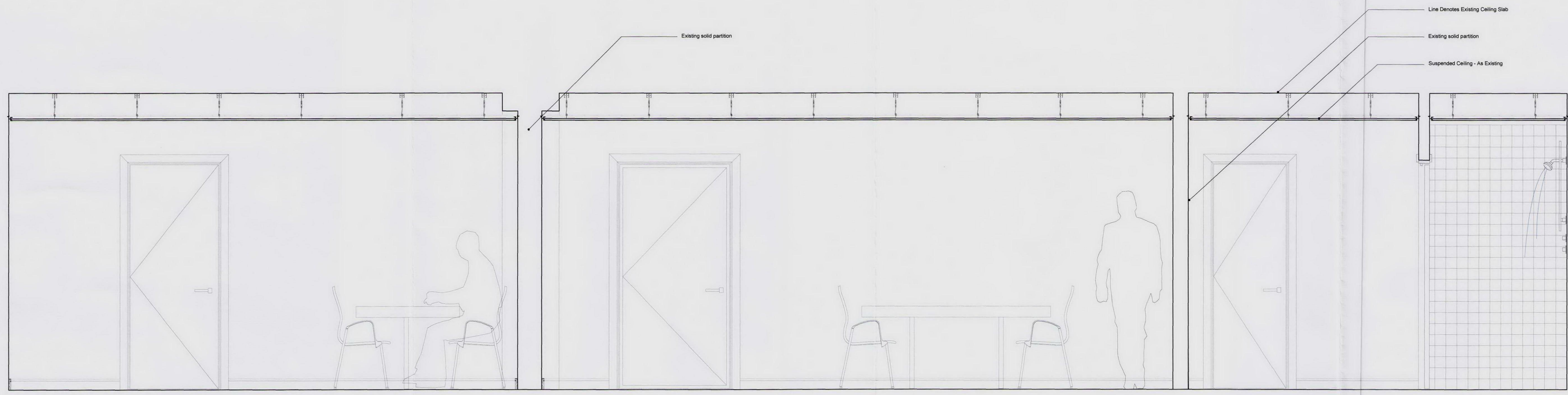
EXECUTIVE OFFICE 1

Copyright of this drawing is owned by FDArchitecture - do not reproduce, distribute without written consent. The general contractor and/or all sub-contractors working from these plans and specifications are not to scale such information but to contact the architect or his representative regarding measurements. If such measurements do not appear correct, add up properly or scale correctly to the indicated size. FDArchitecture 38 Exmouth House Pine Street London EC1R 0JH