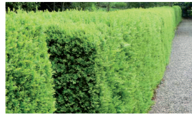
6. double hedge: low hedging: common box