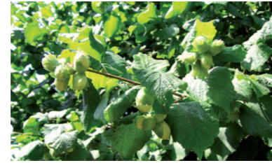
native hedging: hazel