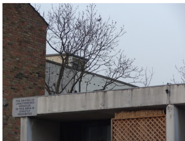
Views of existing rear dormer at 4 St Paul's Mews, as seen from road level in St Paul's Crescent