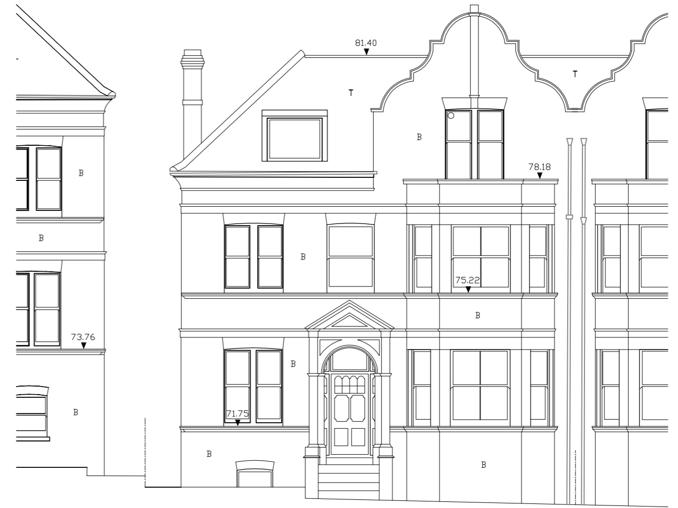
2 EXISTING FRONT ELEVATION 1 : 100