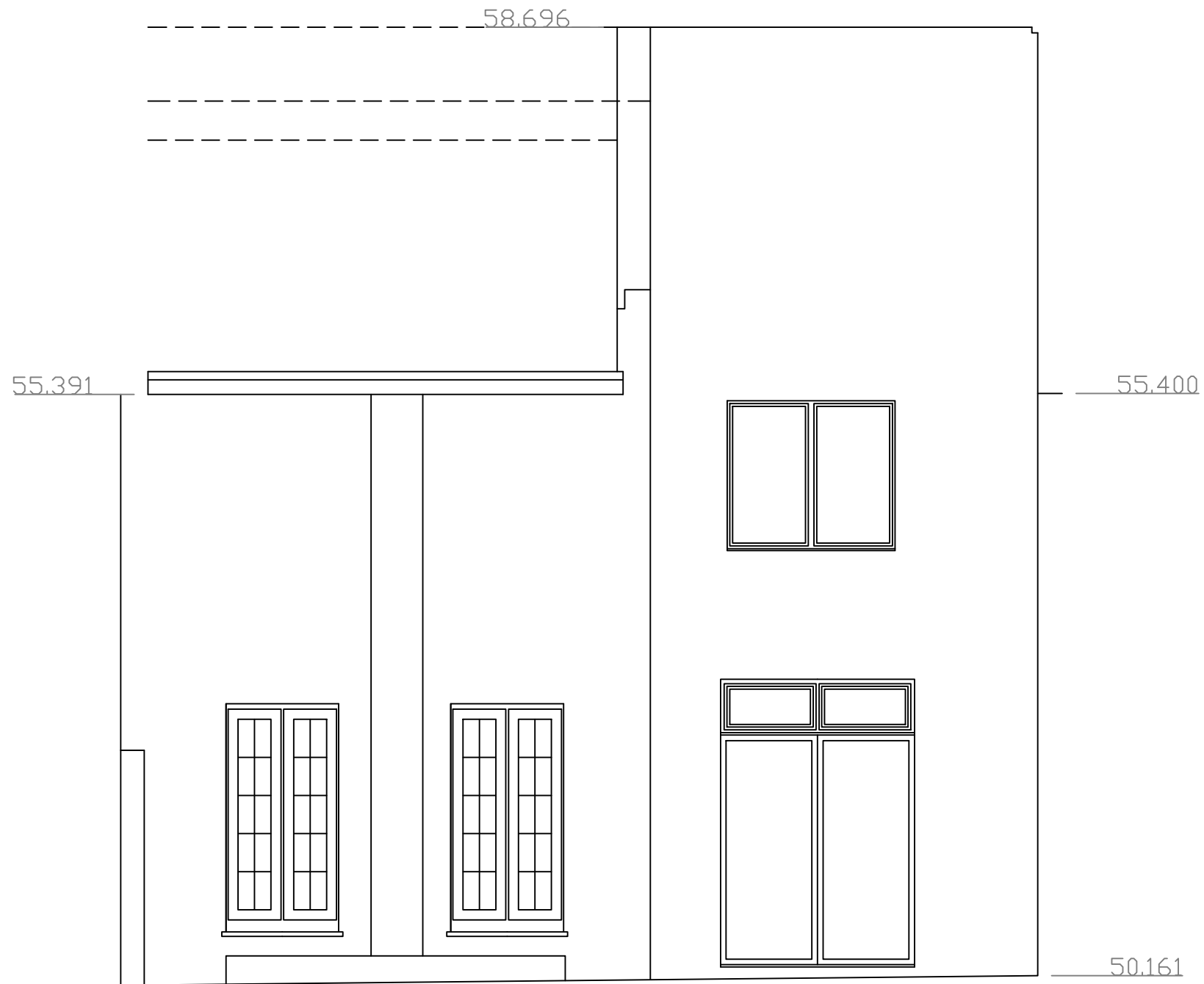
ELEVATION 3 EXISTING