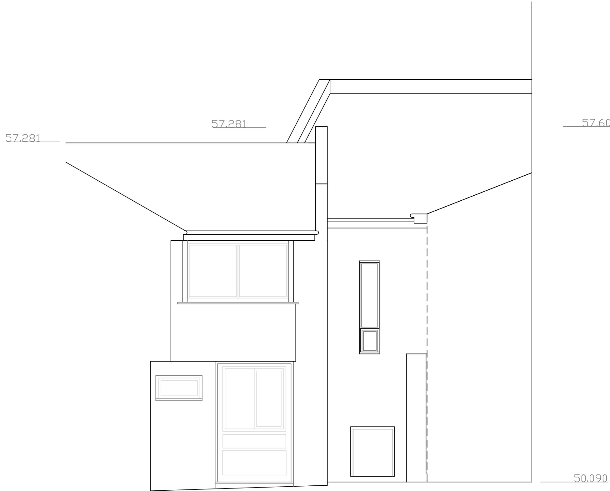
ELEVATION 1 EXISTING