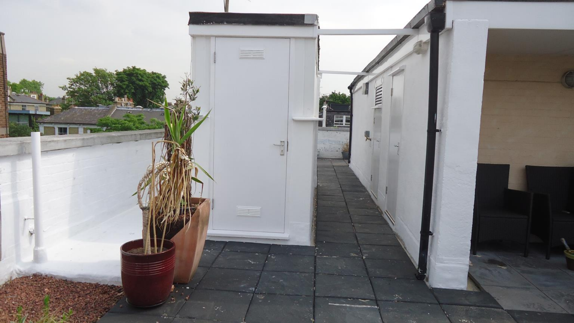
LOOKING EAST PAST ALCOVE