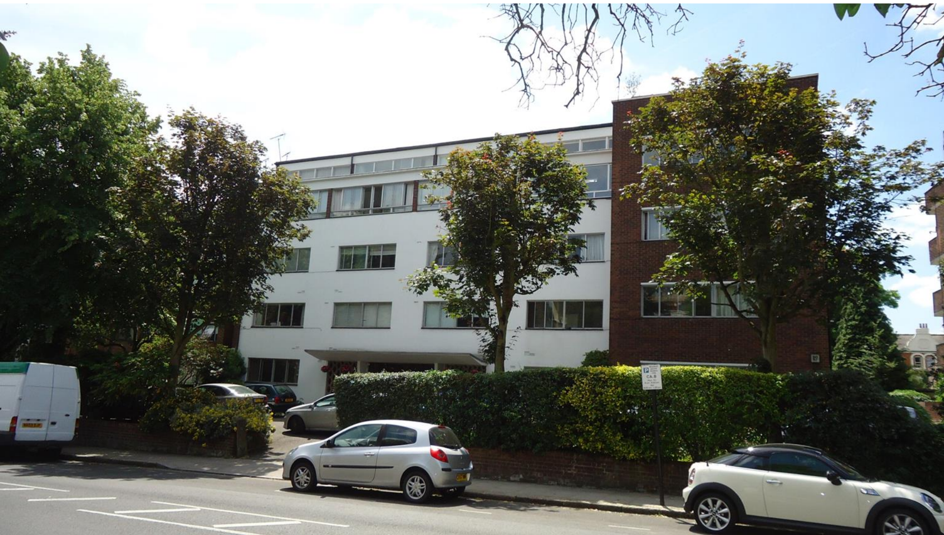
LOOKING WEST FROM HAVERSTOCK HILL