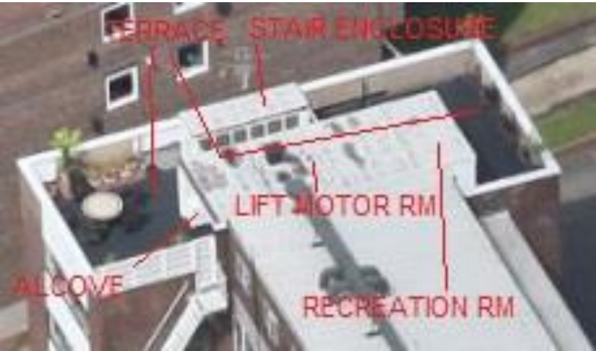
AERIAL CLOSE-UP VIEW