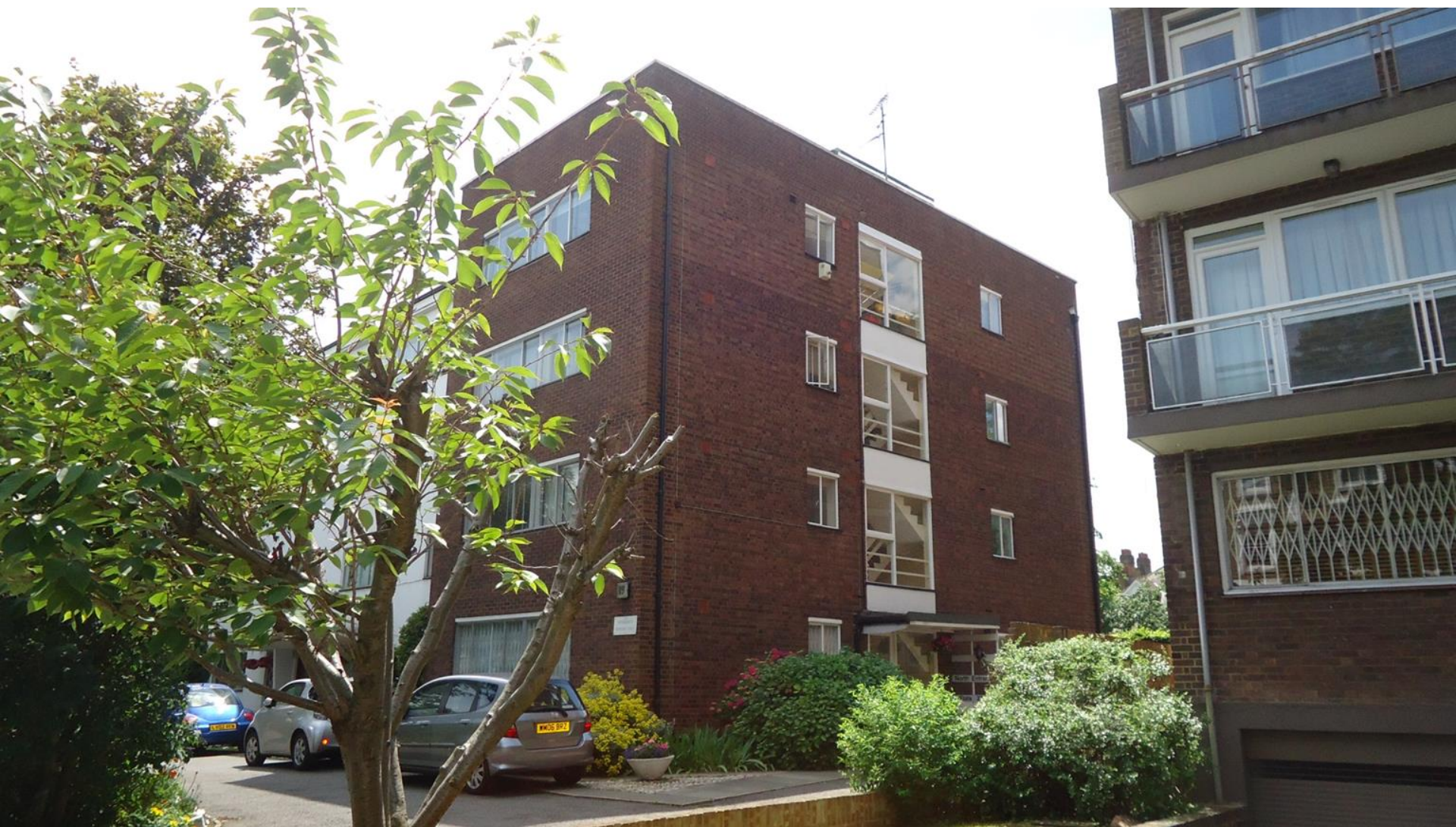
LOOKING SOUTH FROM HAVERSTOCK HILL