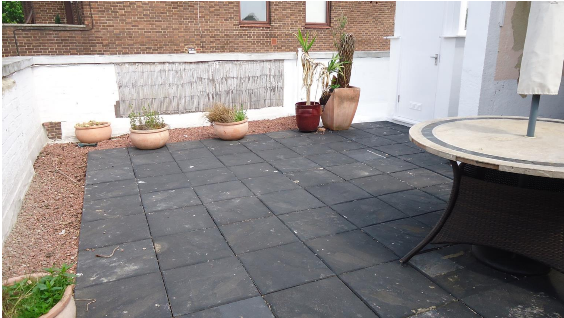
LOOKING TOWARDS 121 HAV HILL