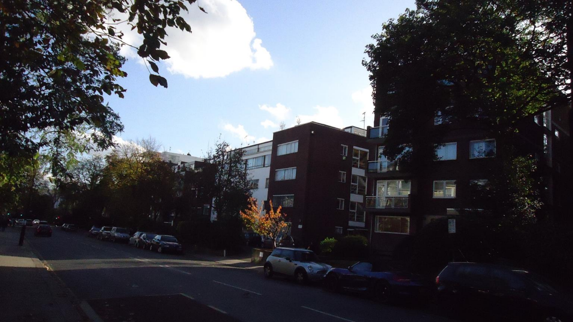
LOOKING SOUTH FROM HAVERSTOCK HILL