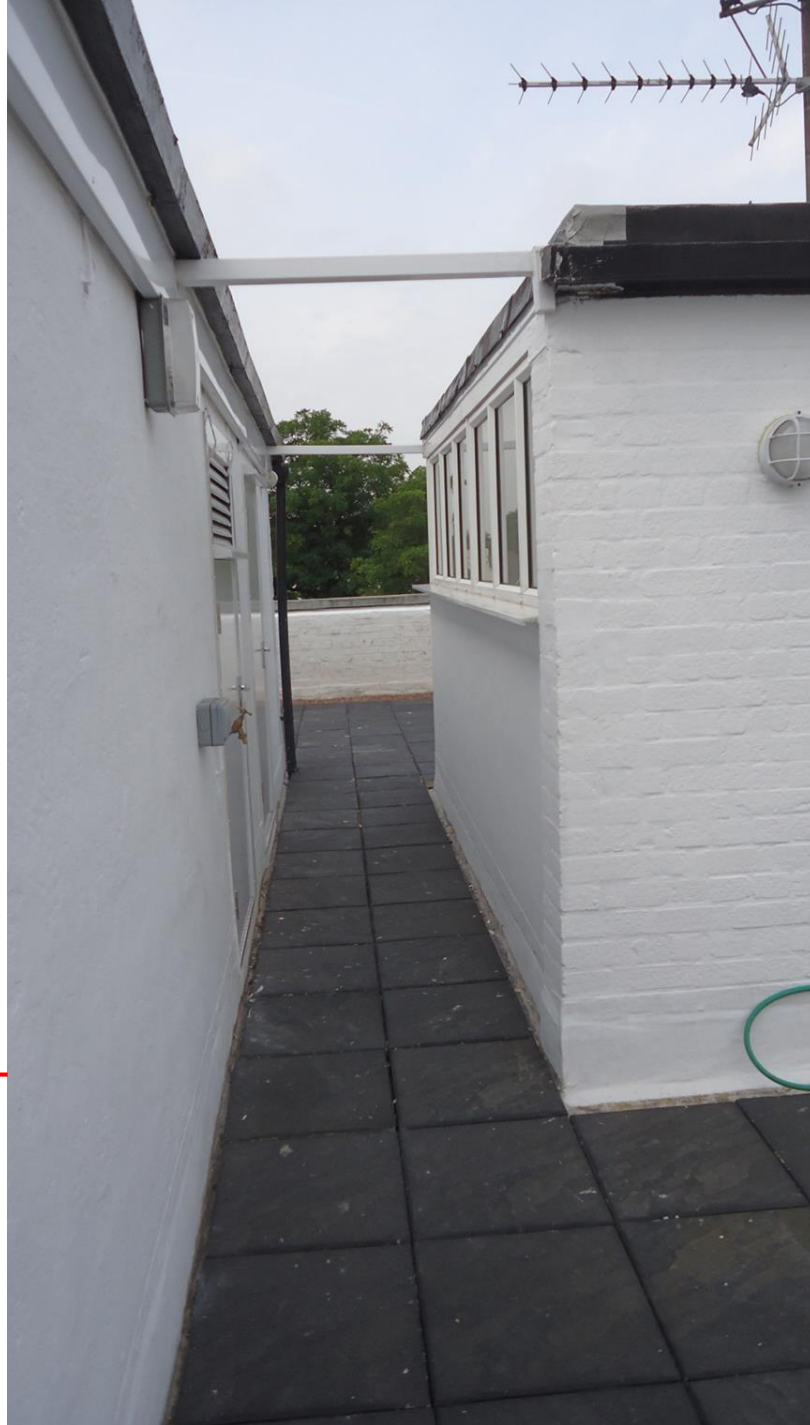
LOOKING EAST PAST STAIR ENCLOSURE