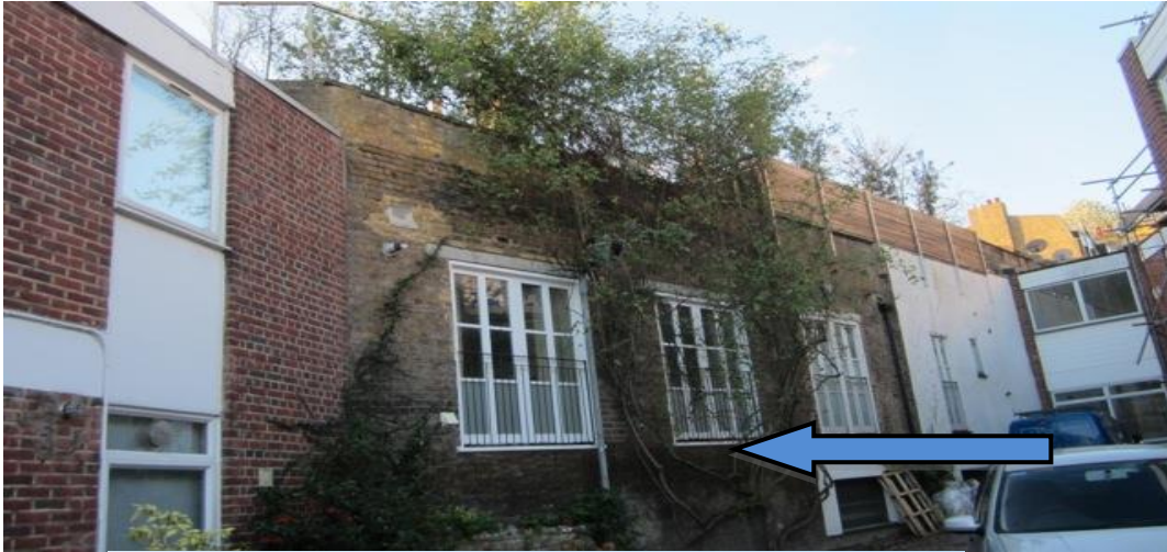
Belsize Park Mews