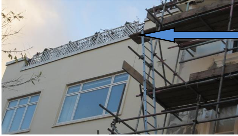
Buckland Crescent, front façade