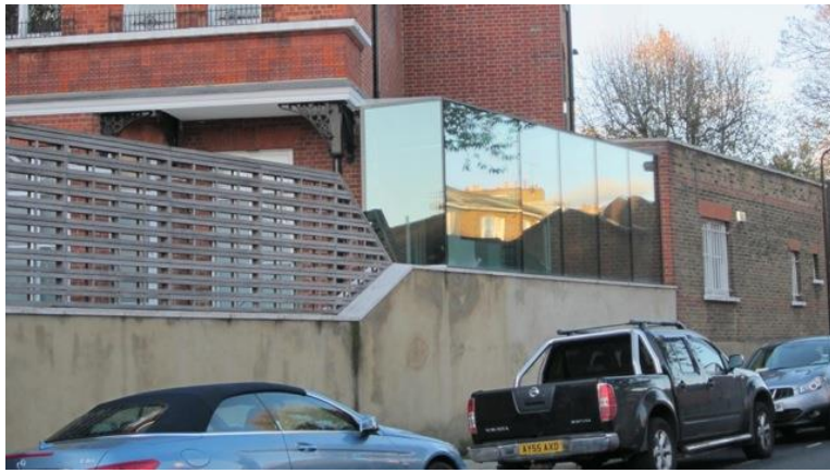
Corner of Daleham Gardens and Belsize Lane