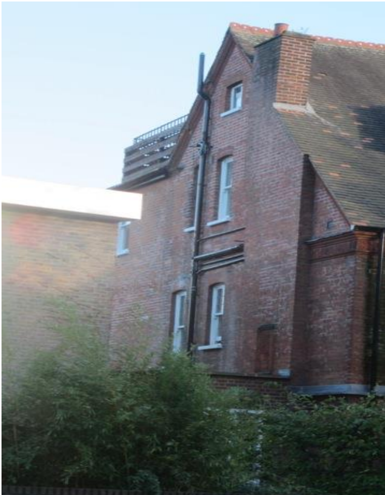
30 Daleham Gardens