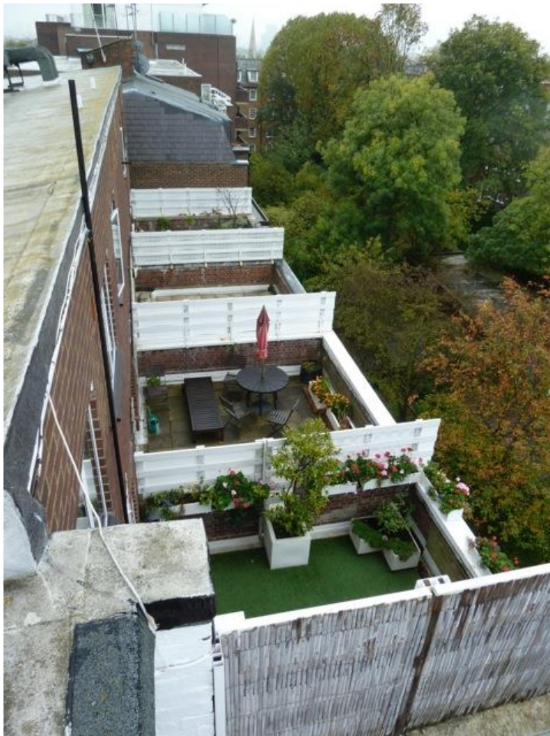
Roof terraces of 119 Haverstock Hill, showing all with privacy fences

Note: The picture below illustrates the SW facing side of the block at no. 119. It shows that all the terraces in the block, apart from the terrace belonging to Flat 29 (not shown), already enjoy the privacy and amenity these privacy screens can provide.