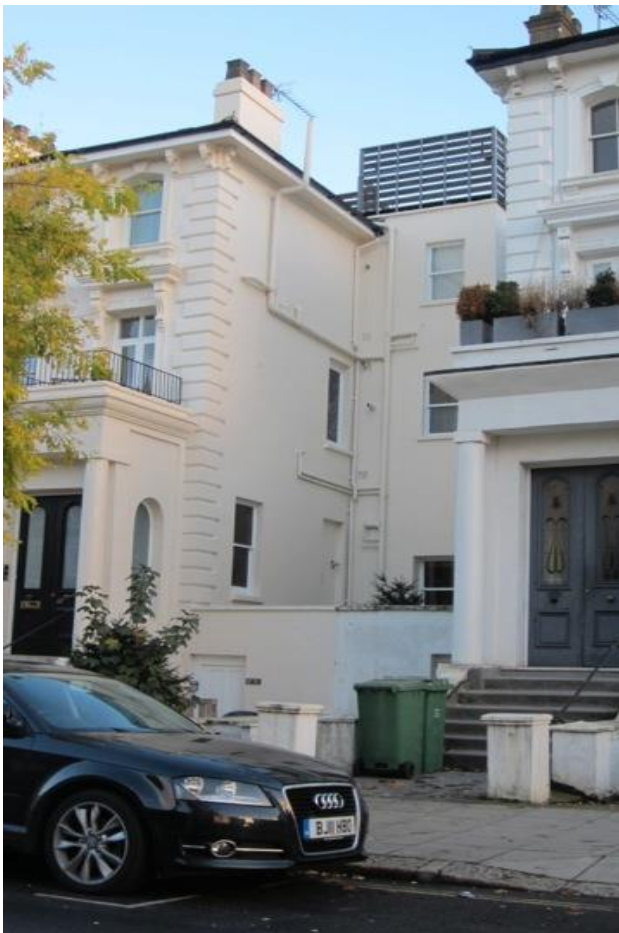
47 Buckland Crescent