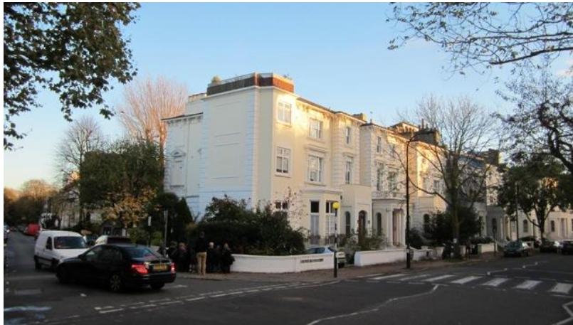
Corner of Buckland Crescent and Lancaster Grove