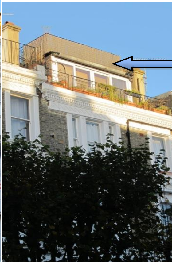
8 Belsize Crescent