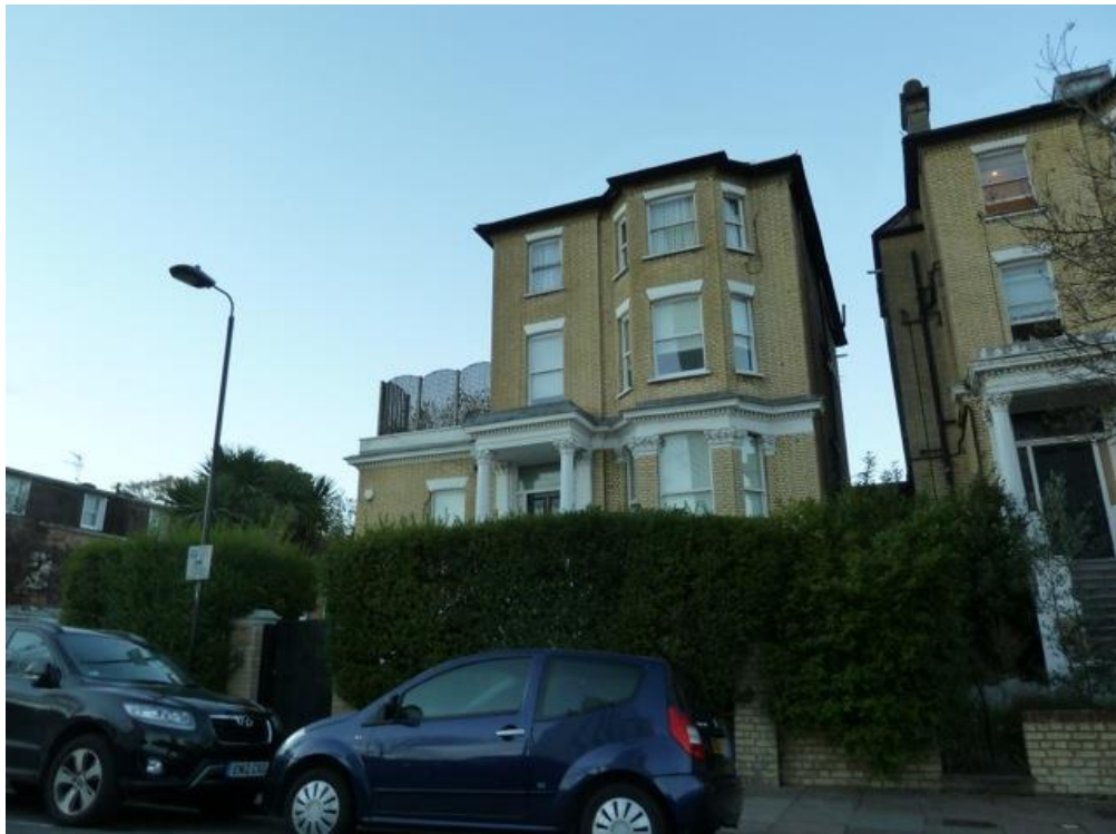
Corner of Fellows Road and Merton Rise