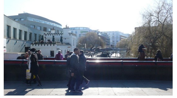
Existing view 01: from bridge on Camden High Street

Proposed view 01 from Camden High Street