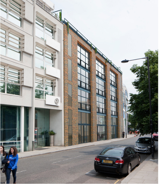
Previously consented view 02: from Jamestown Road