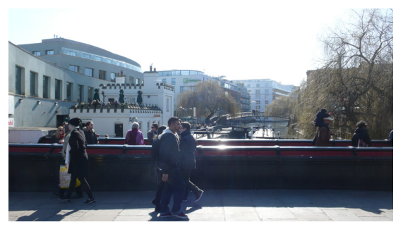
Previously consented view 01: from bridge on Camden High Street

The re-imagined facades for 32 Jamestown Road are underpinned by a strong desire to reflect and enhance the Regent's Canal conservation area. Strong, vertical masonry piers running into the canal echo the fenestration patterns of neighbouring canalside buildings and the Interchange Building opposite. A step in the masonry façade at third floor level continues the cornice line of the adjacent Holiday Inn, while the brick façade a level above is terminated by a steel channel coping. The vertical emphasis of the buildings masonry piers is enhanced by deep, recessed window openings separated by concrete spandrel panels and elegant projecting steel balconies. In such a way, the main building structure reflects a contemporary take on the canalside typology. The upper levels and terraces are a lightweight foil, with minimal, sliding glass walls and generous planting to provide green amenity space for the office accommodation at roof level.