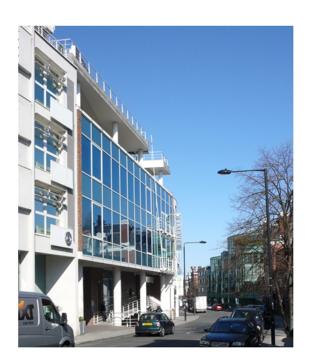
Existing view 02: from Jamestown Road

The façade to Jamestown Road largely continues the treatment proposed to Regent's Canal. Red brick masonary piers provide an honest reflection of the buildings structural frame, creating generous glazed openings that are subdivided by concrete spandrel panels at each floor level. At ground level a number of entry and servicing requirements are incorporated within the street elevation including the principal entrance to the building, an electricity substation and bin collection facilities. To ensure that the treatment of this façade is not subsumed by this range of activities it is proposed that infill glazing is retained to match that used elsewhere. Where appropriate to obscure internal views or to facilitate ventilation - a mesh screen will be sandwiched into the glazing system, maintaining the overall composition of the elevation while allowing these various functions to coexist in a well-ordered whole. An elegant canopy projects over the pavement to Jamestown Road demonstrating the building entrance.