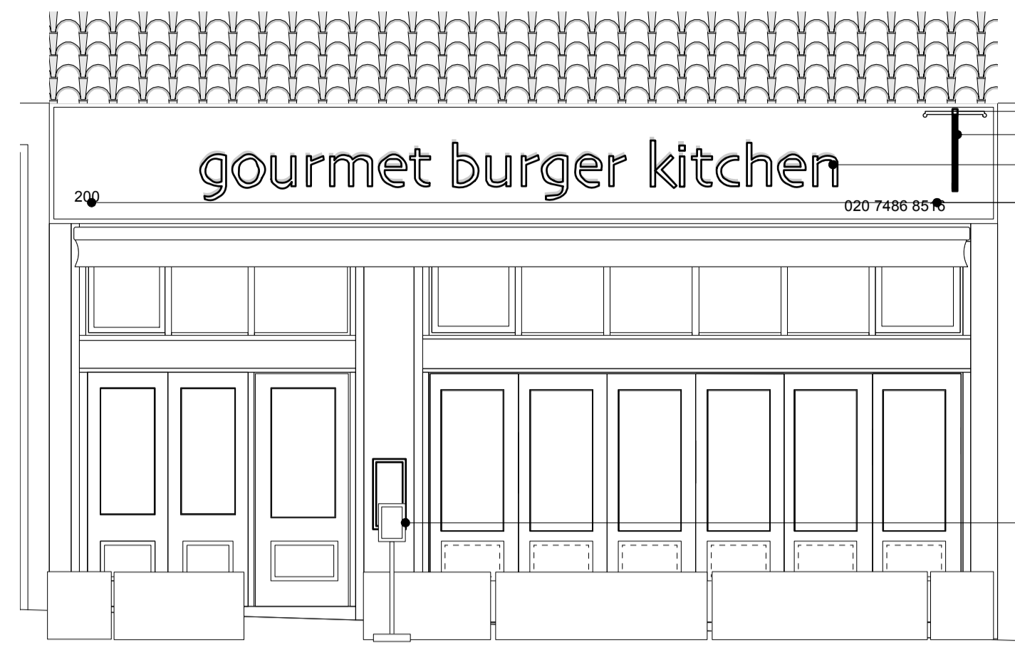
EXISTING ELEVATION AWNING CLOSED/ EXTERNAL PLANTING SCALE 1:50@A1, 1:100@A3