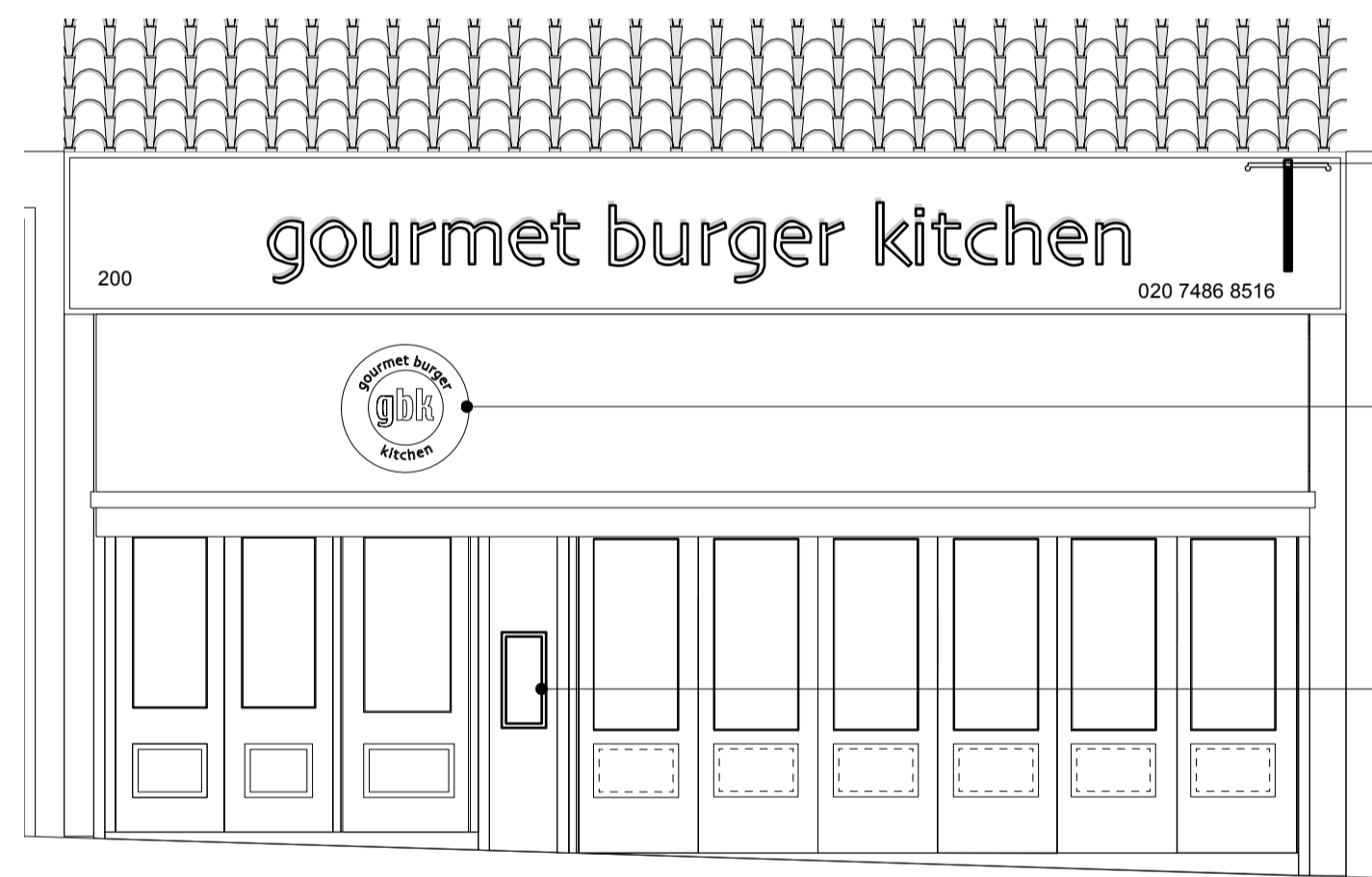
EXISTING ELEVATION AWNING OPEN SCALE 1:50@A1, 1:100@A3

PROJECTING SIGNAGE TO BE REMOVED REMOVE FASCIA ABOVE INCLUDING: -LARGE GBK TEXT -TELEPHONE NUMBER -PROPERTY NUMBER