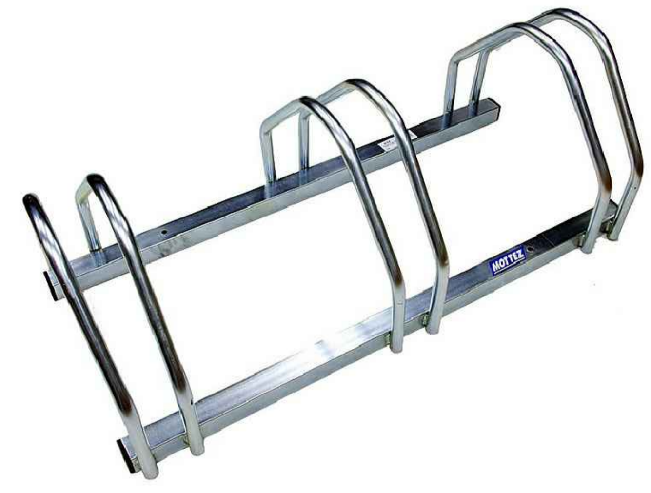
3 BIKE STORE - MOTTEZ 3-BIKE STAND 720 x 330mm 1/20