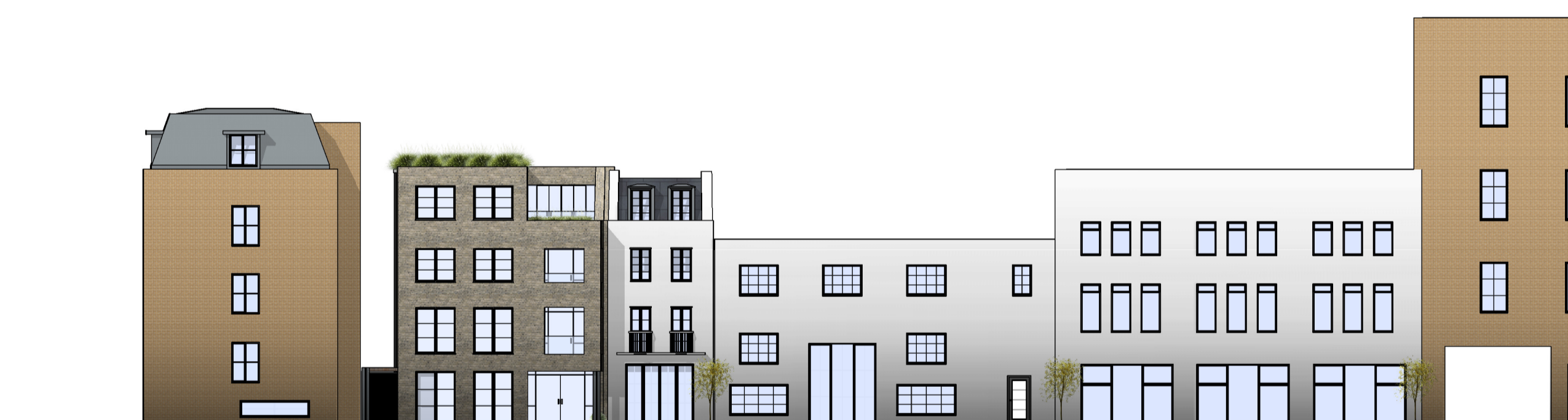
2 elevation plane 1 + 2