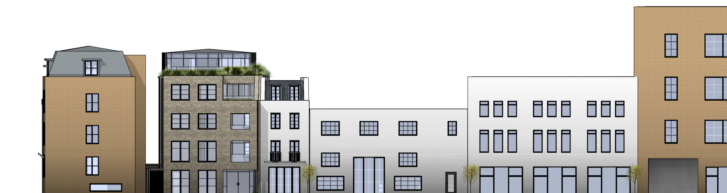
3 elevation plane 1 + 2 + 3