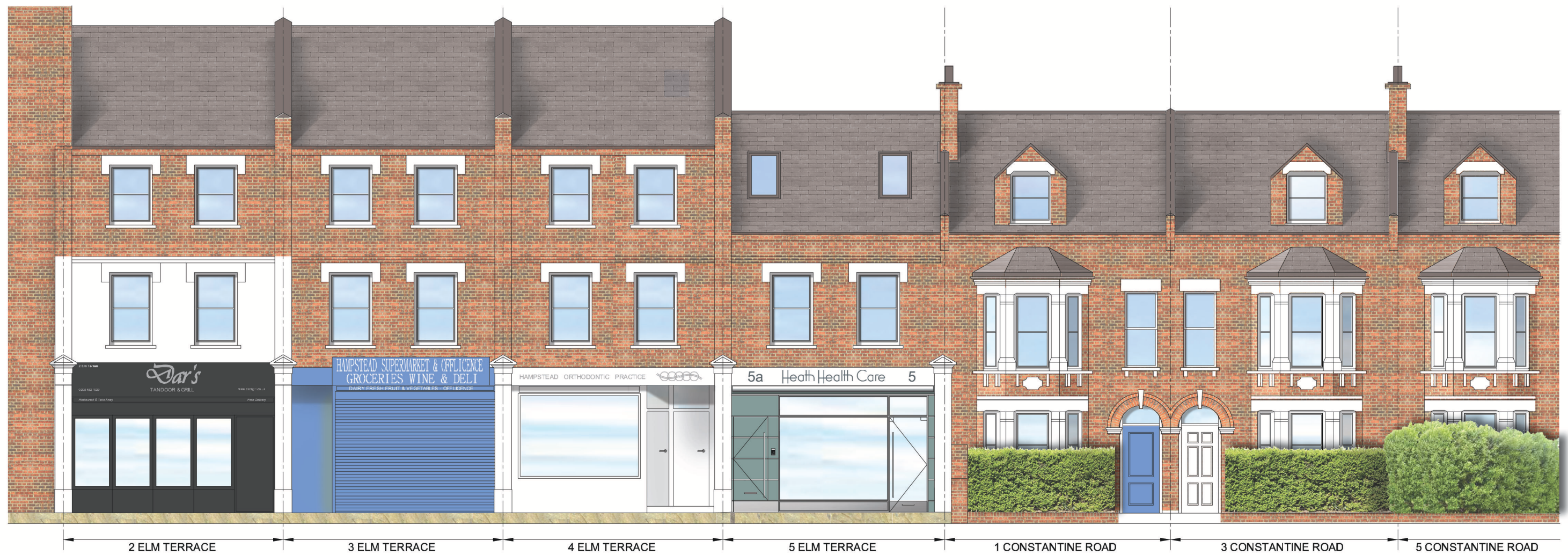
CONTEXT ELEVATION WITH PROPOSED SHOPFRONT SCALE 1:100