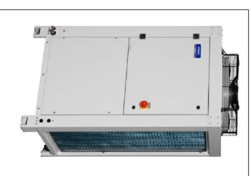
Proposed new heat pumps