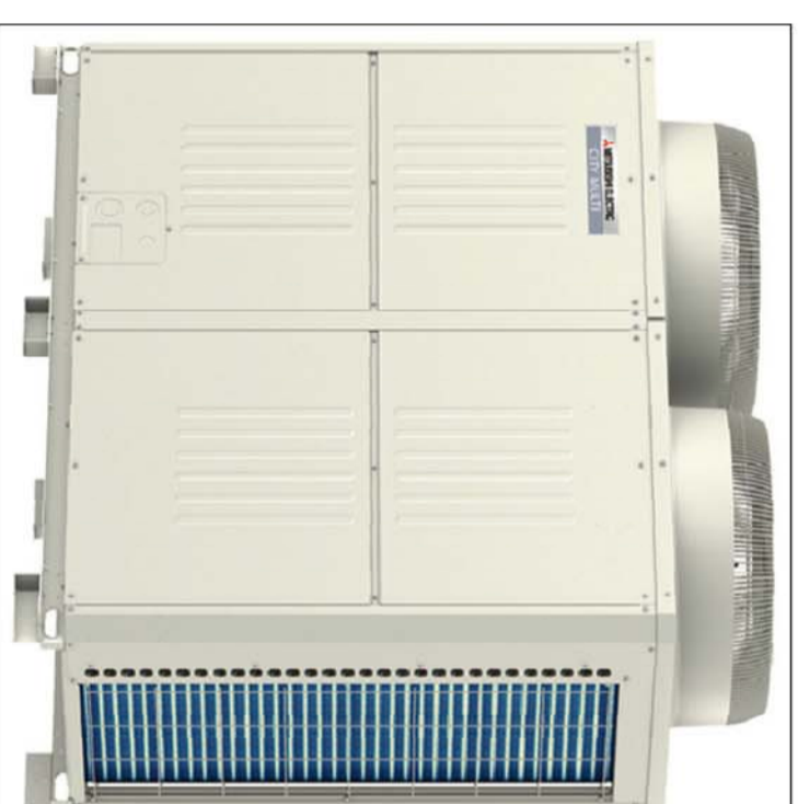
Proposed new VRF units