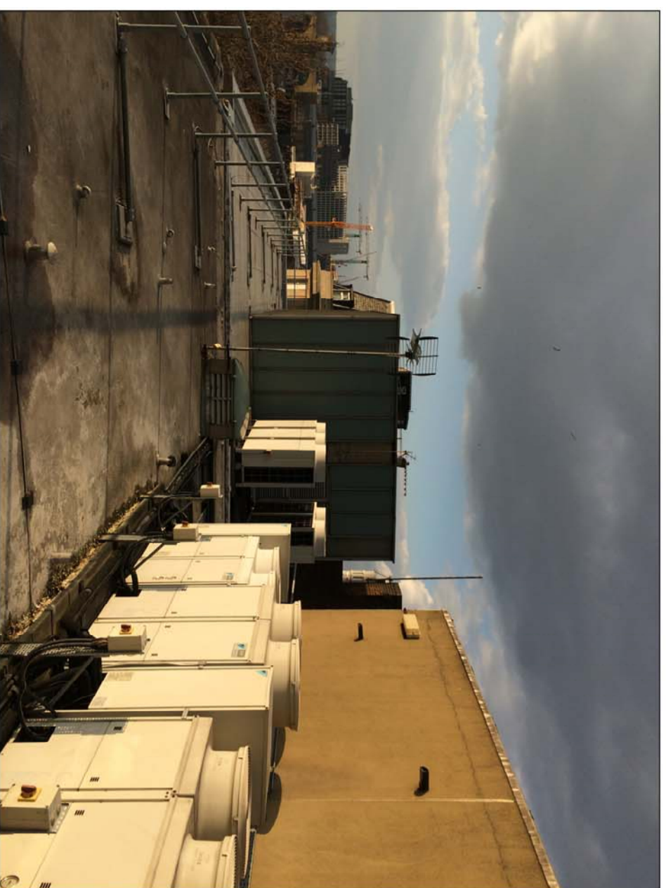
Existing plant on roof