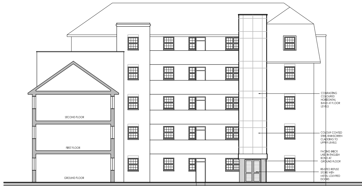
NEW EAST ELEVATION