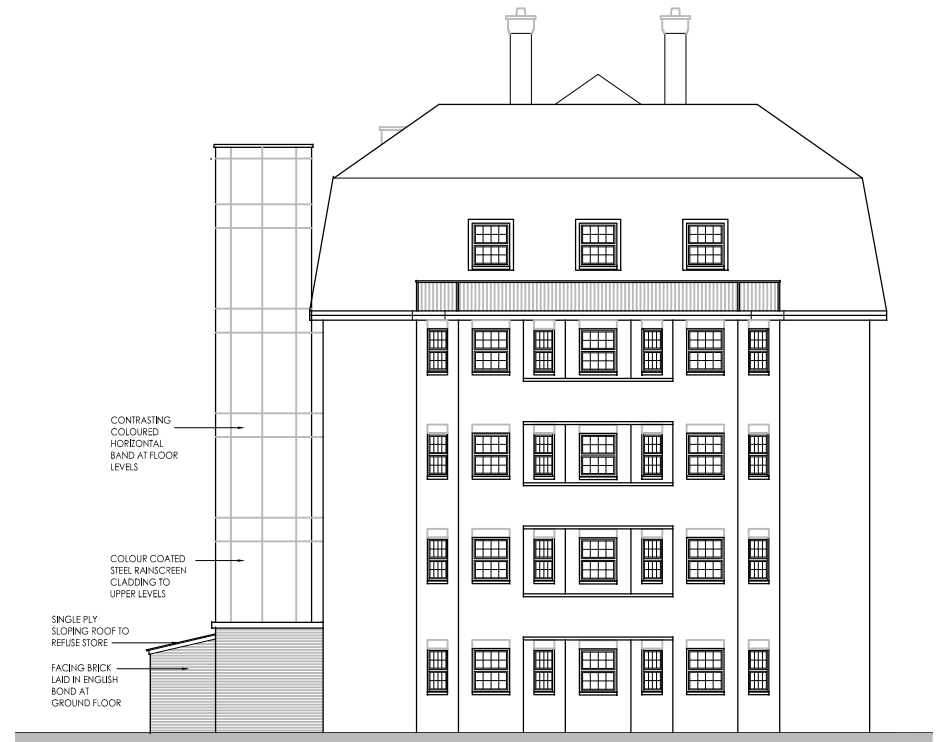
NEW NORTH SIDE ELEVATION