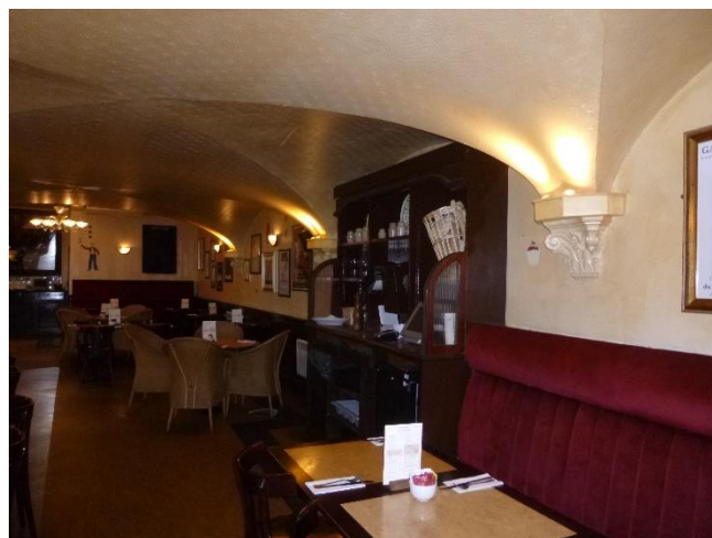
Right side of restaurant