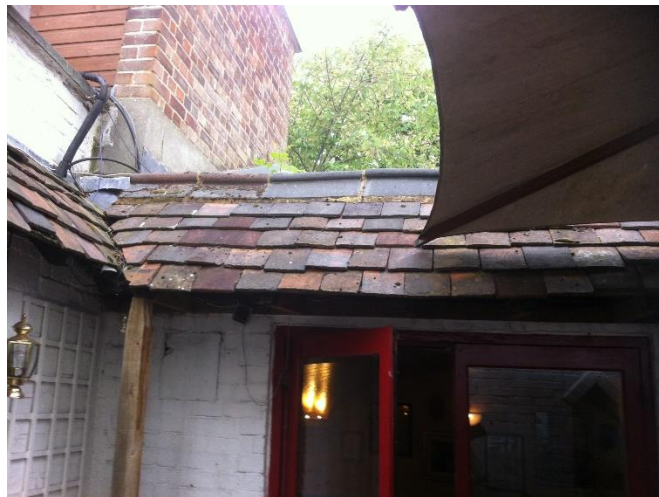
Canopy to be removed in courtyard