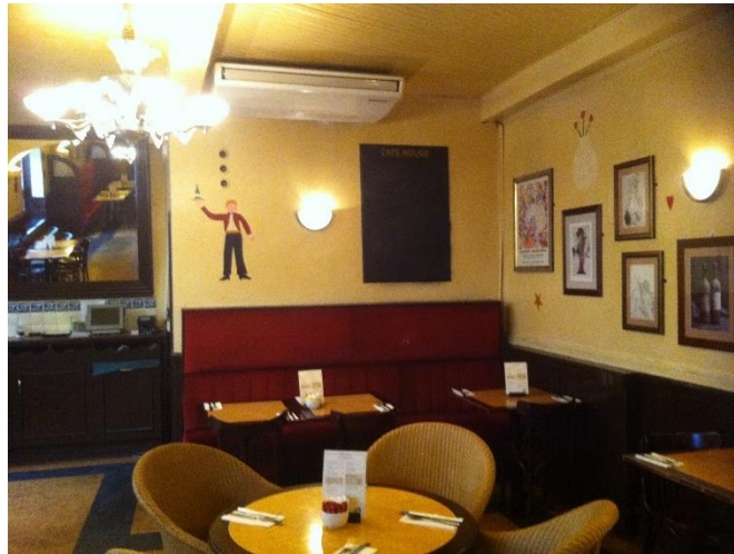
Rear store to be replaced with new bar servery