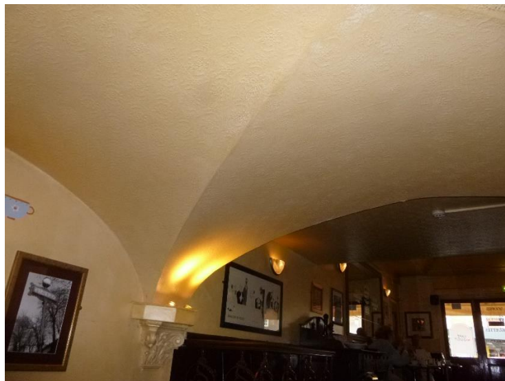
Modern vaulted ceiling to be cut back