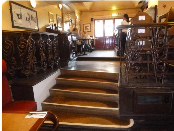
Existing stairs to be covered over