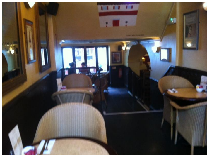
Side stairs to be infilled