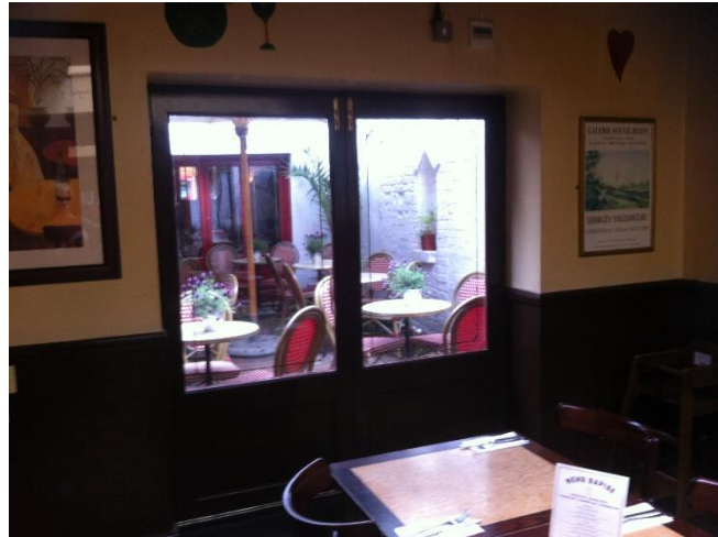
Doors from restaurant to courtyard