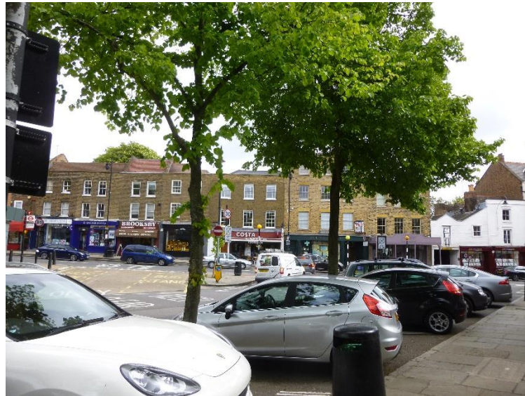
Highgate High Street