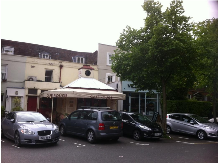
Café Rouge, 6-7 South Grove, Highgate