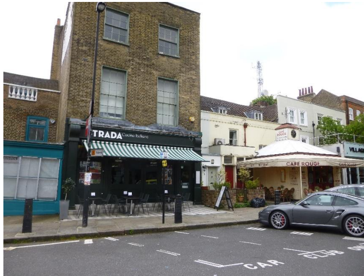
Strada, 5 South Grove