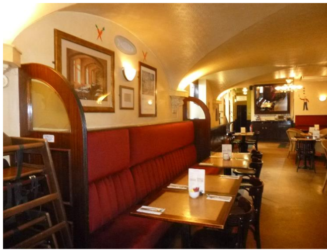
Left side of restaurant