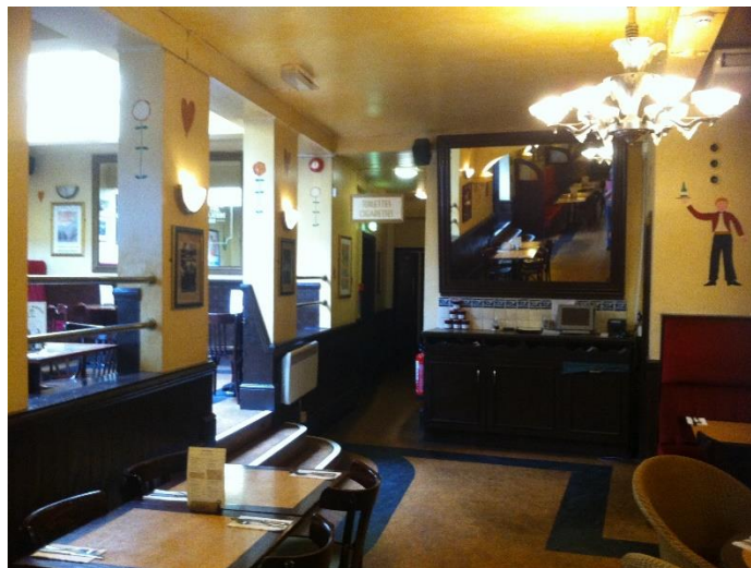
Position of proposed wine shelves