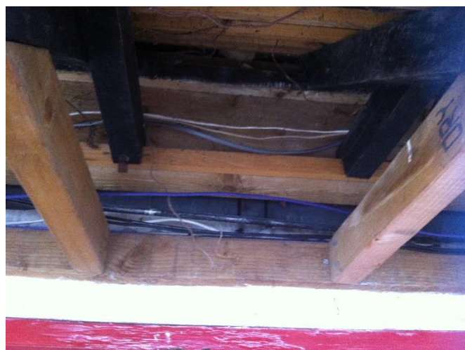
Underside of canopy to be removed