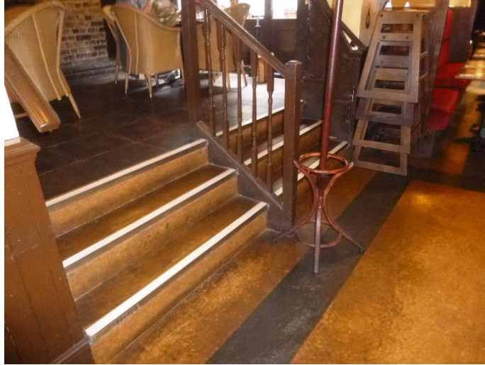
Side stairs to be altered