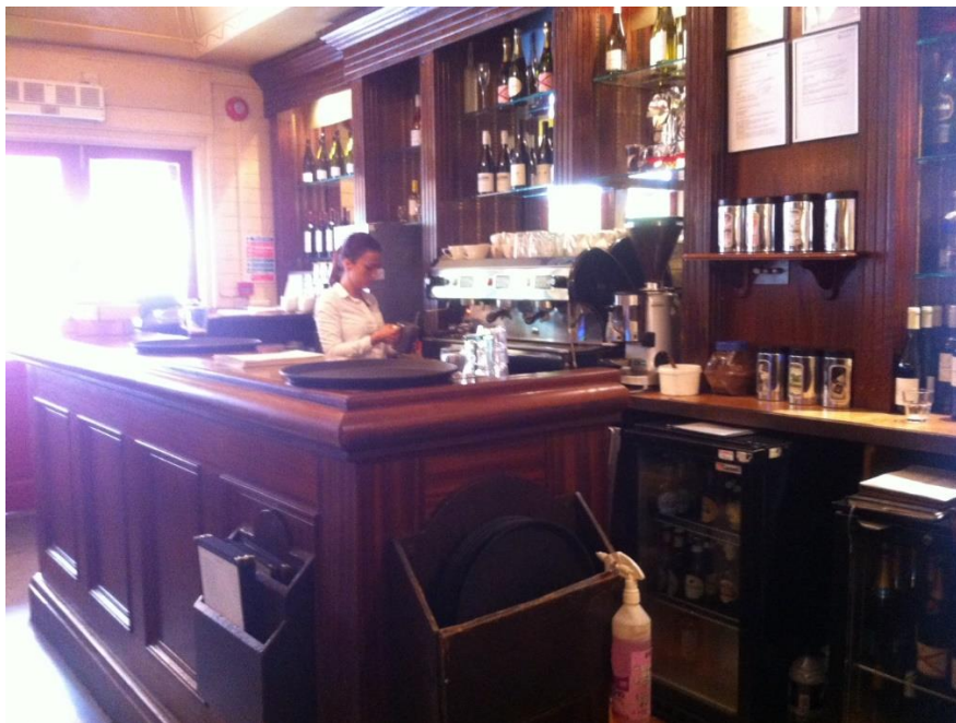
Existing modern bar to be removed