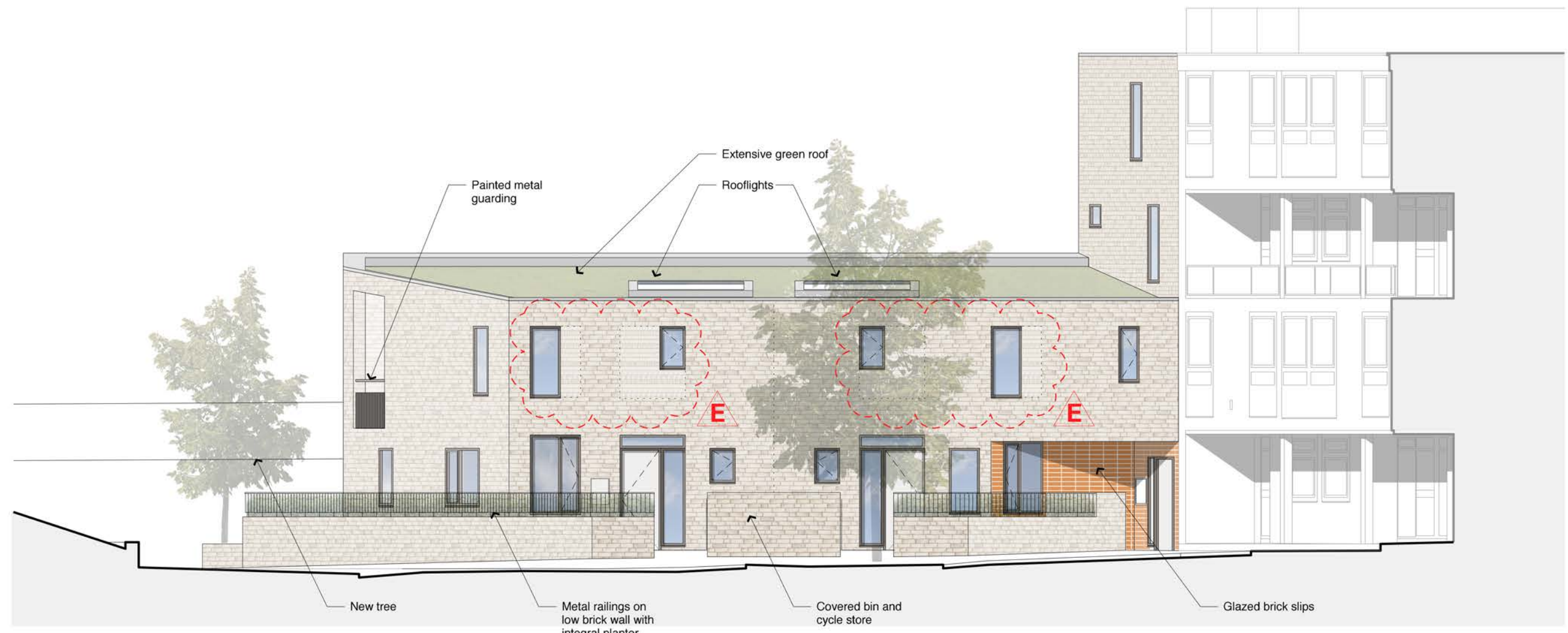
North Elevation (facing Barrington Close and railway in distance)