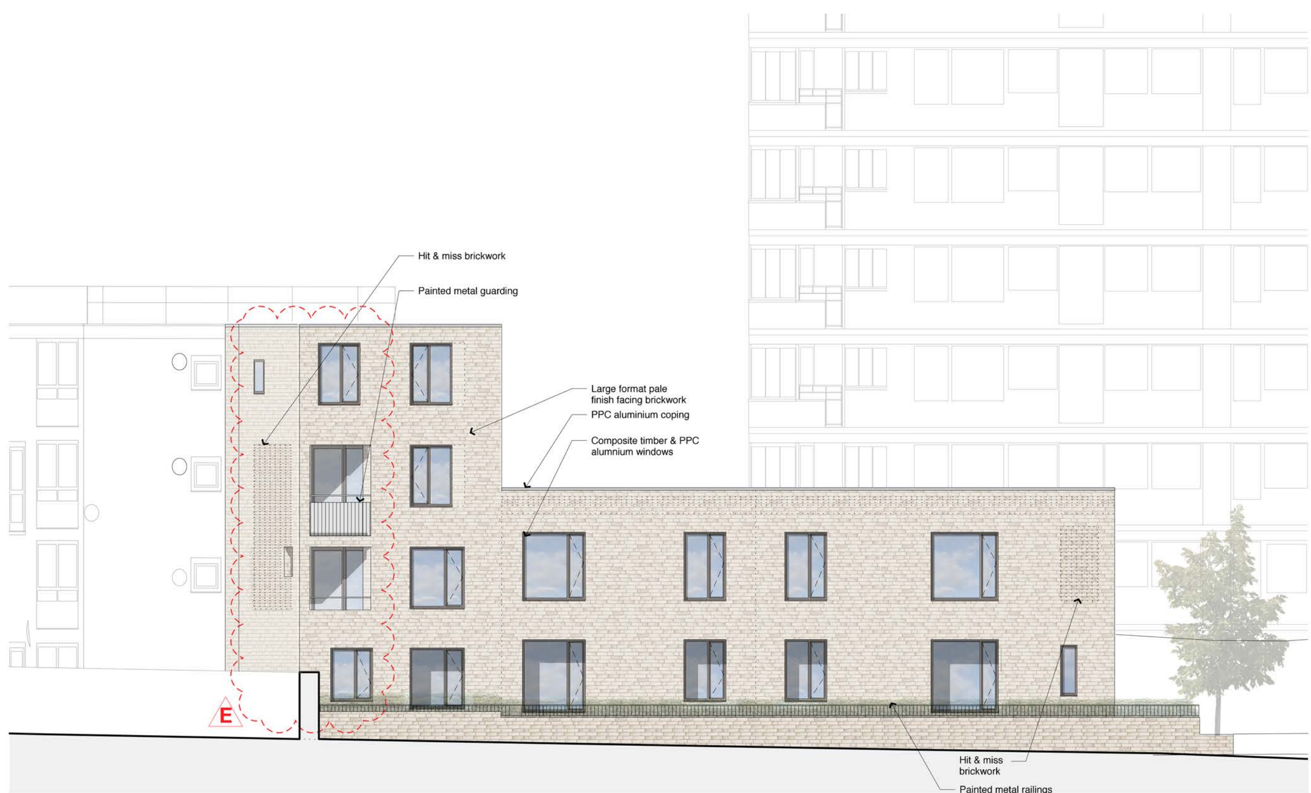
South Elevation (facing Railway Path)