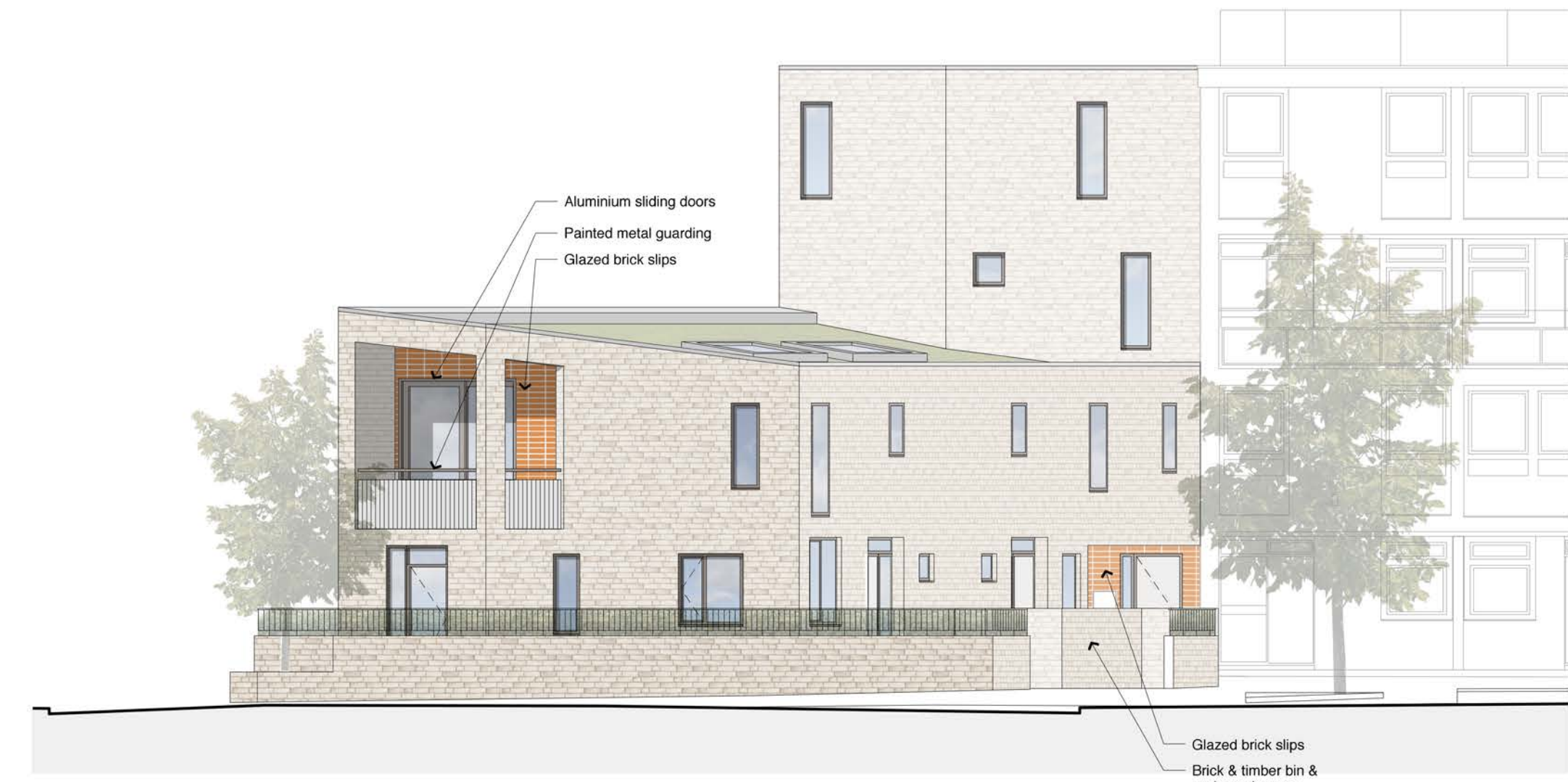
East Elevation (facing Barrington Close)