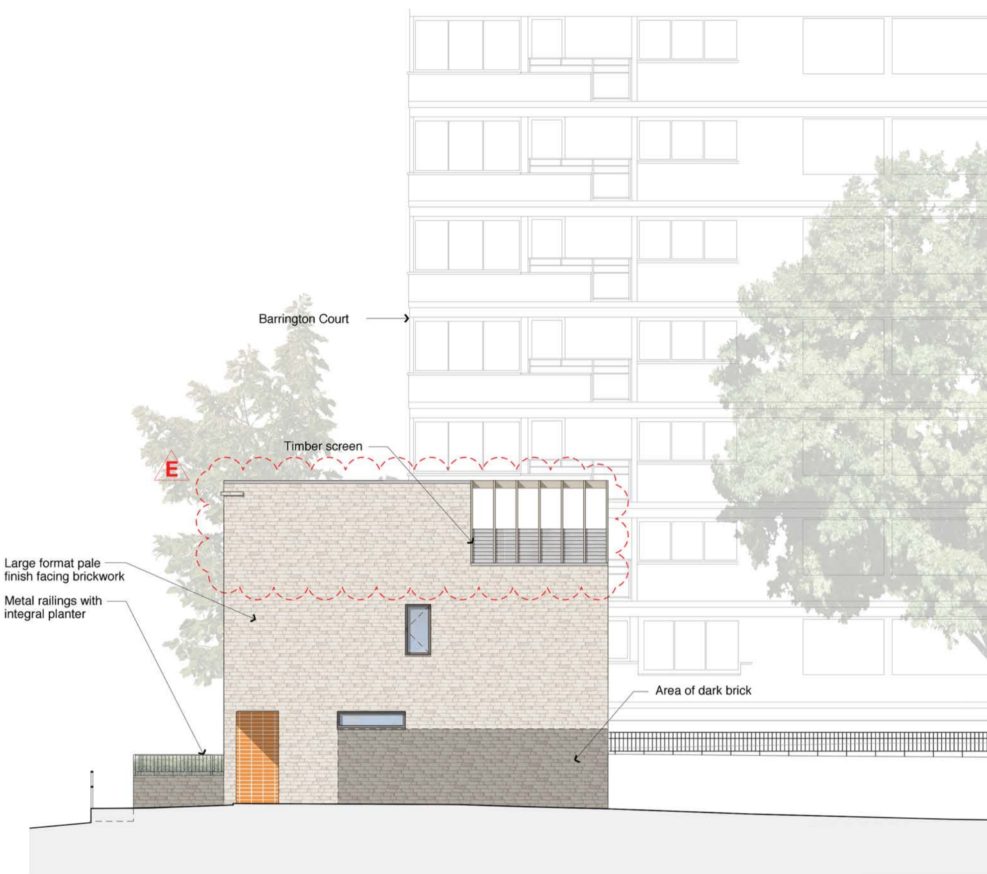
West Elevation (to Lamble Street Passage)