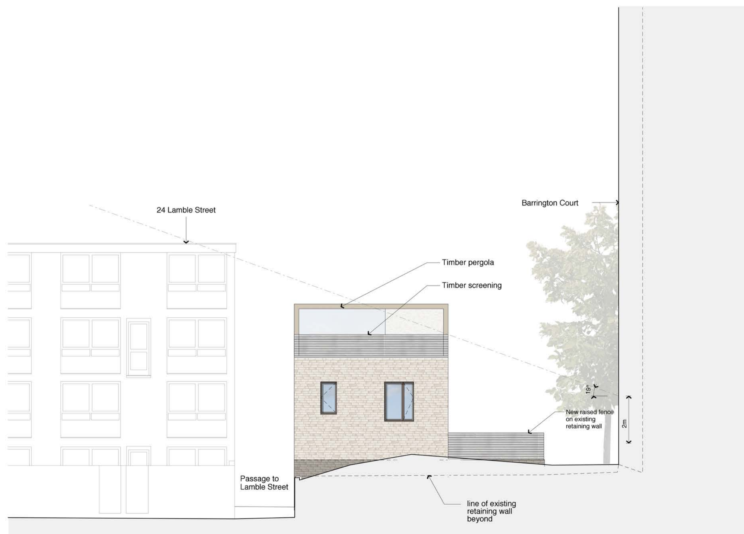
South Elevation (to Barrington Close)