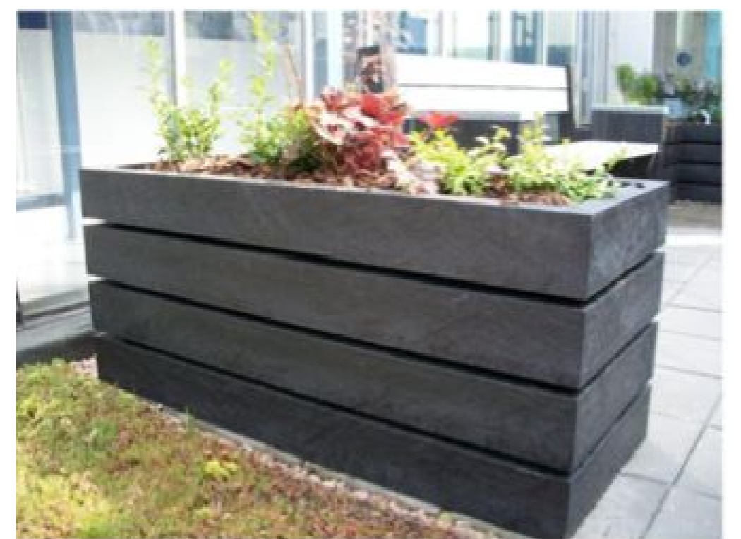
Modular Planter suggested by Architect on drawing 1625/P/301 B