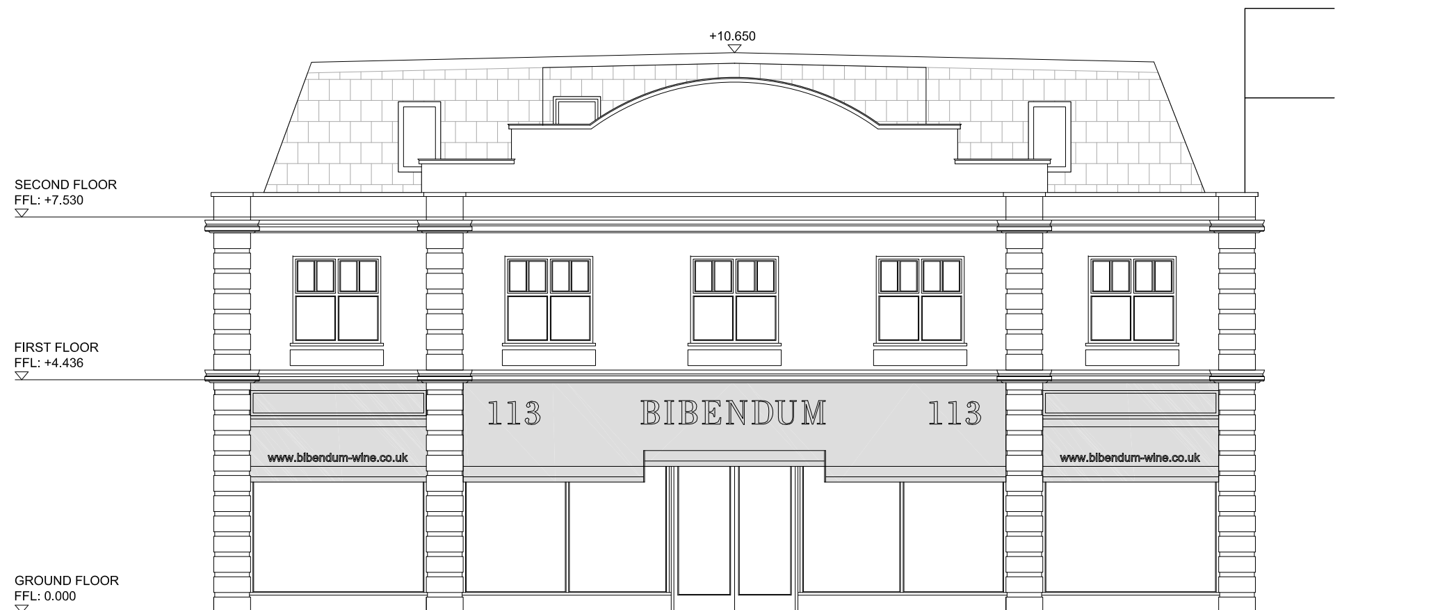
1 Existing East Elevation SCALE 1:50 @ A1 / 1:100 @ A3