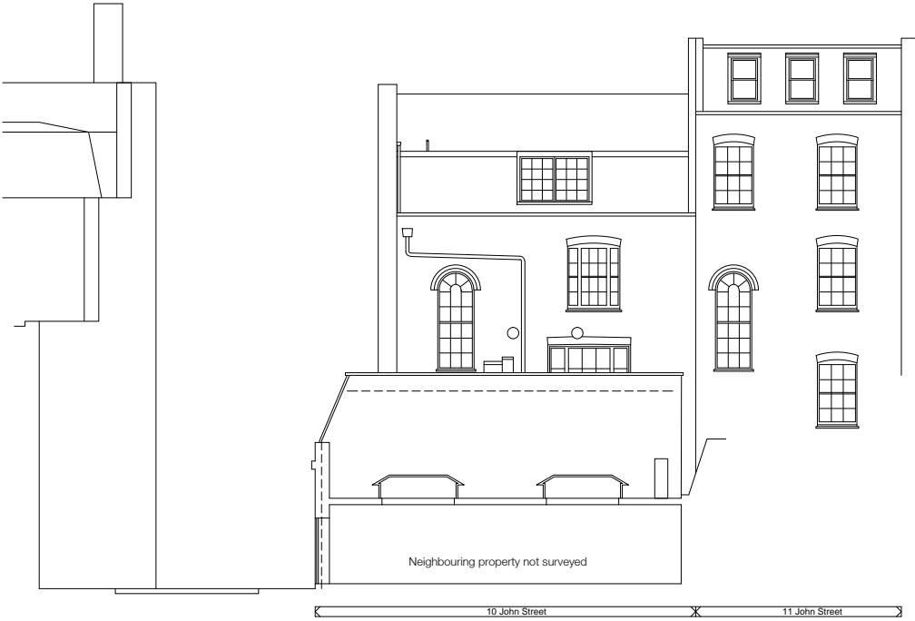
SECTIONAL REAR ELEVATION