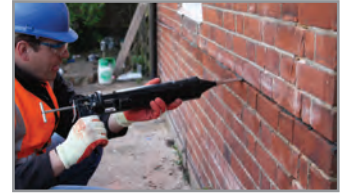
5. Insert a further bead of HeliBond over the exposed HeliBar, finishing 12mm from the face, and 'iron' firmly into the slot using the HeliBar Insertion Tool