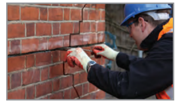
4. Using the HeliBar Insertion Tool, push one HeliBar into the grout to obtain good coverage