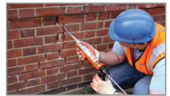
6. Re-point the mortar bed and make good the vertical crack with CrackBond TE3