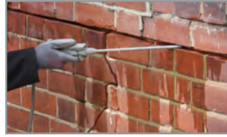
2. Clean out slots and flush with clean water and thoroughly soak the substrate within the slot