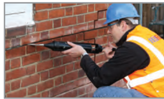
3. Using the Helifix Pointing Gun, inject a bead of HeliBond along the back of the slot