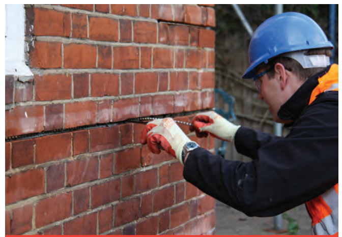
HeliBar is inserted into HeliBond grout within a cut slot