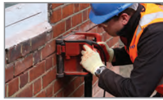
1. Rake out or cut slots into the horizontal mortar beds, a minimum of 500mm either side of the crack