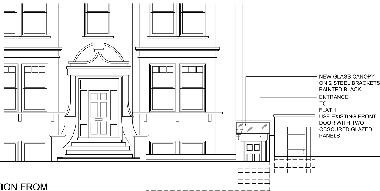
PROPOSED ELEVATION FROM STRATHRAY GARDENS