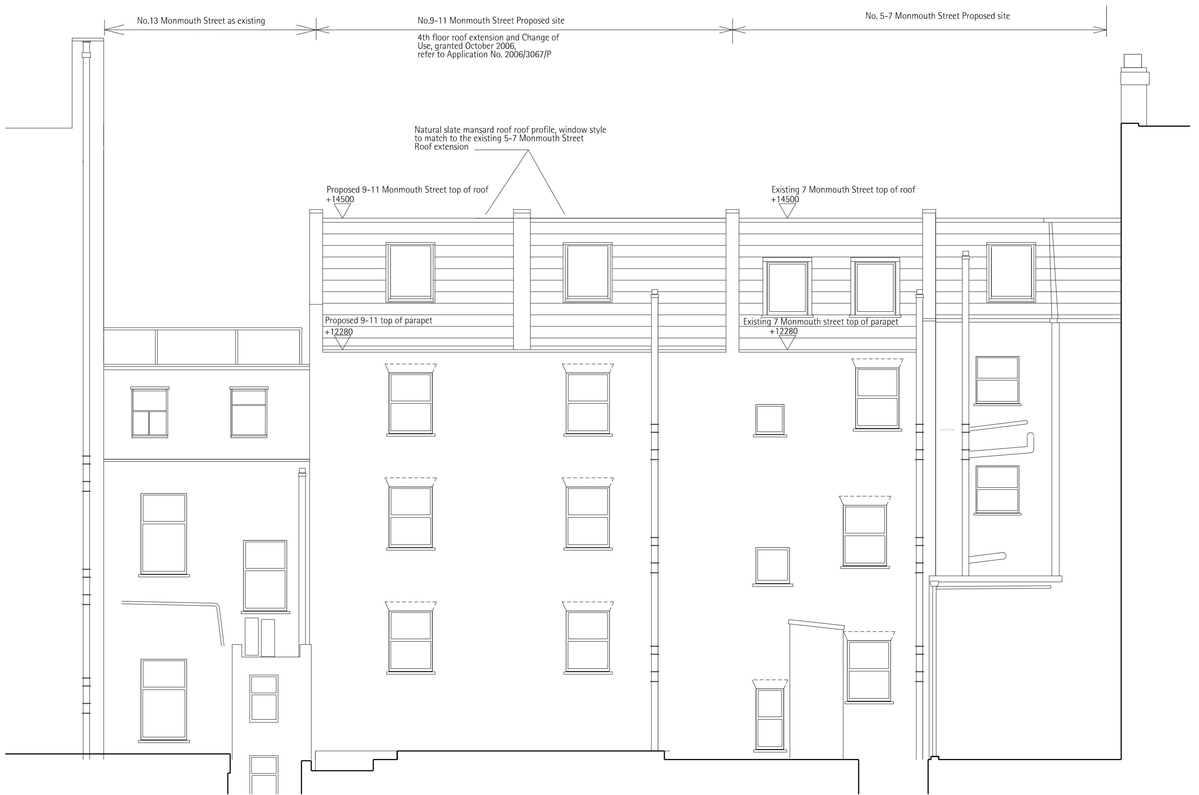
2. Proposed Rear elevation Scale 1:50@A1