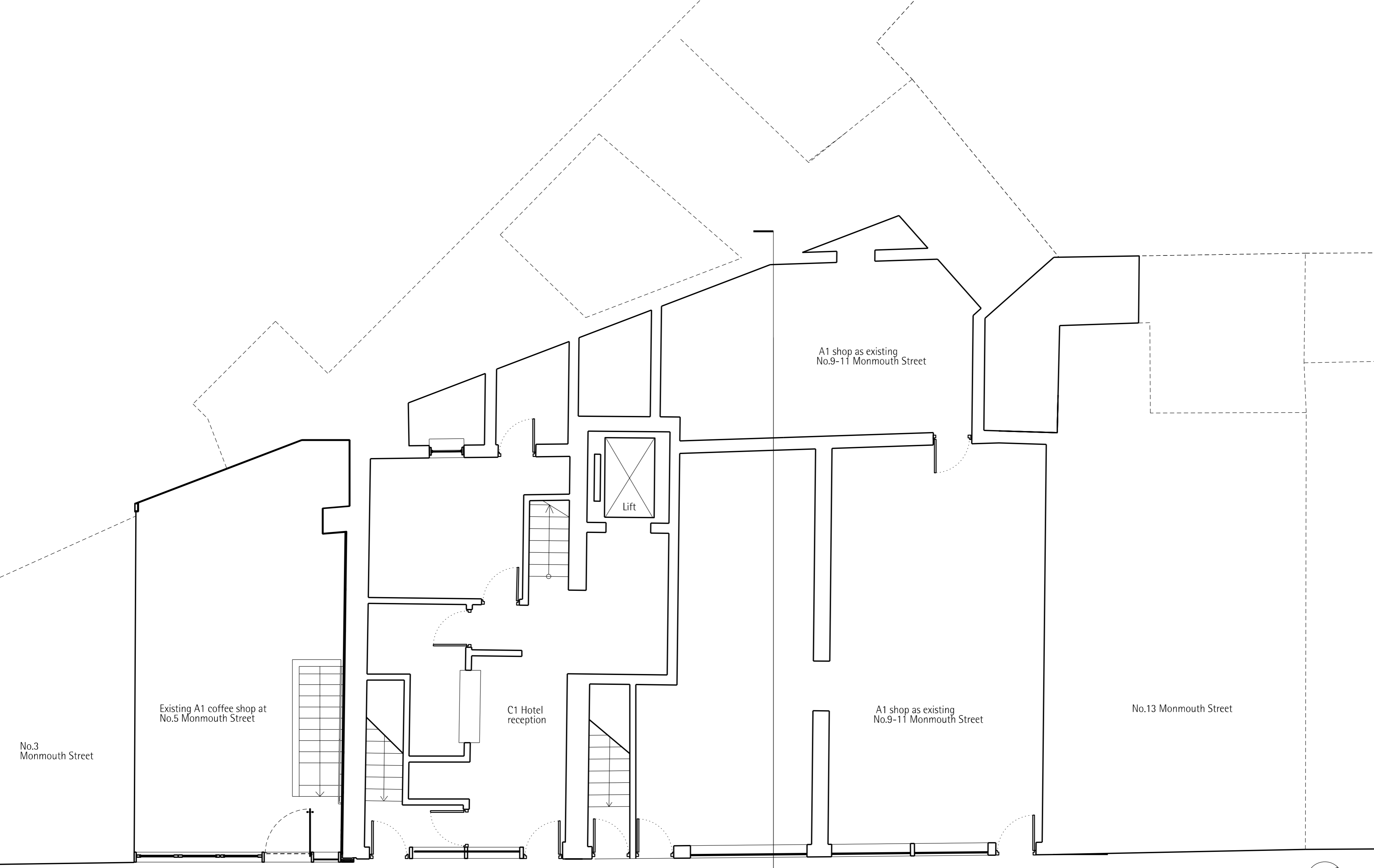
Proposed ground floor plan Scale 1:50@A1