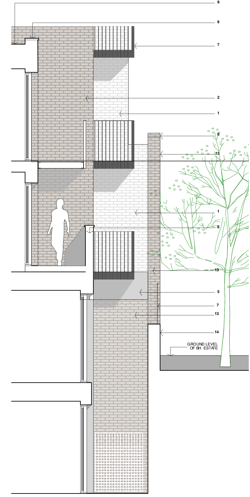
EXTRACT (i) FROM WEST ELEVATION - FACING BIRKENHEAD ESTATE (READ WITH DRAWING No 1506)