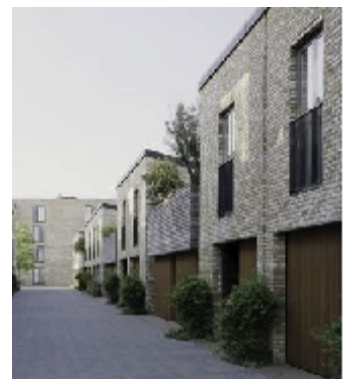
Contemporary terrace/courtyard housing. Architect: FCB Studios