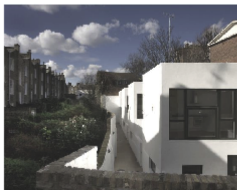
Large high level windows to maximise daylight penetration. Architect: Peter Barber