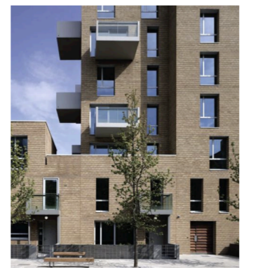
Stepping & recessed massing Architect: Allies and Morrison