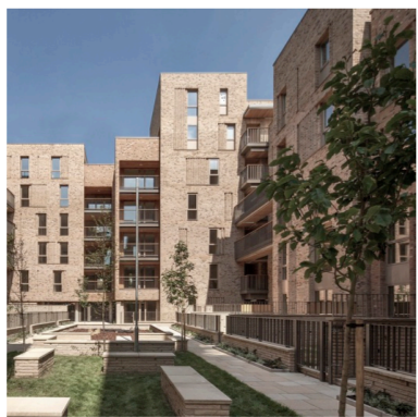
Varying reveals to articulate forms and massing. Architect: Panter Hudspith