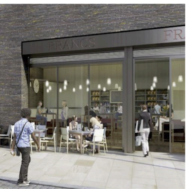
Glazed shopfront to cafe / gallery