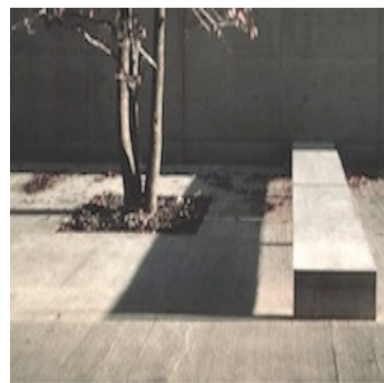
Planting and seating to external open space