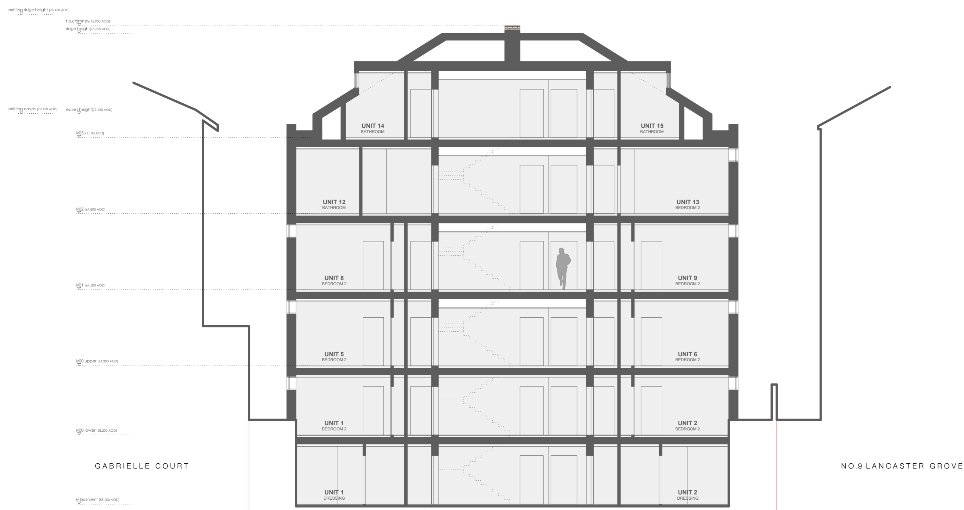
02 PROPOSED SECTION [BB] SCALE 1:100

NOTE: Refer to Studio Engleback information for detail on landscape proposals and levels