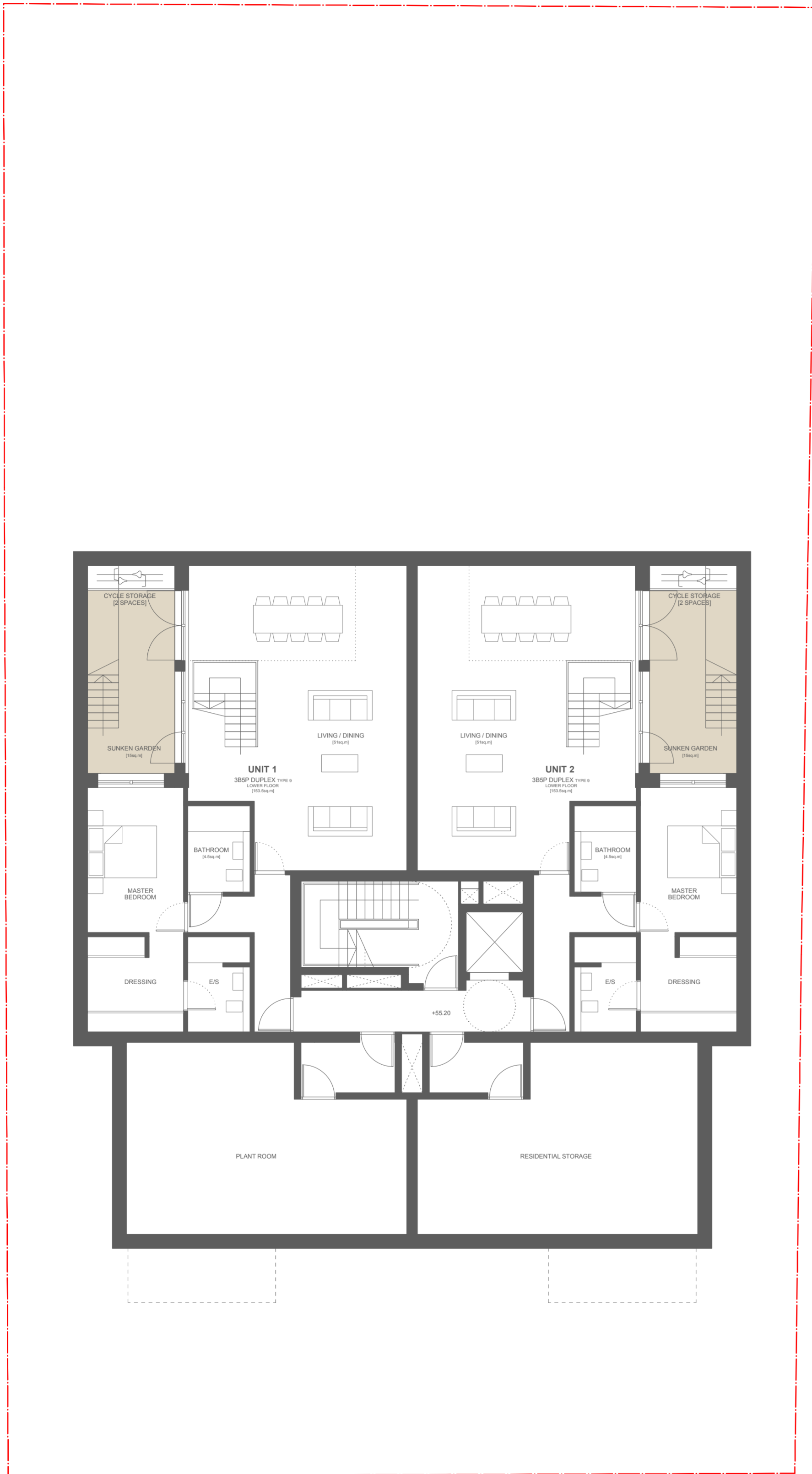
01 PROPOSED BASEMENT LEVEL PLAN SCALE 1:100

NOTE: Refer to Studio Engleback information for detail on landscape proposals and levels