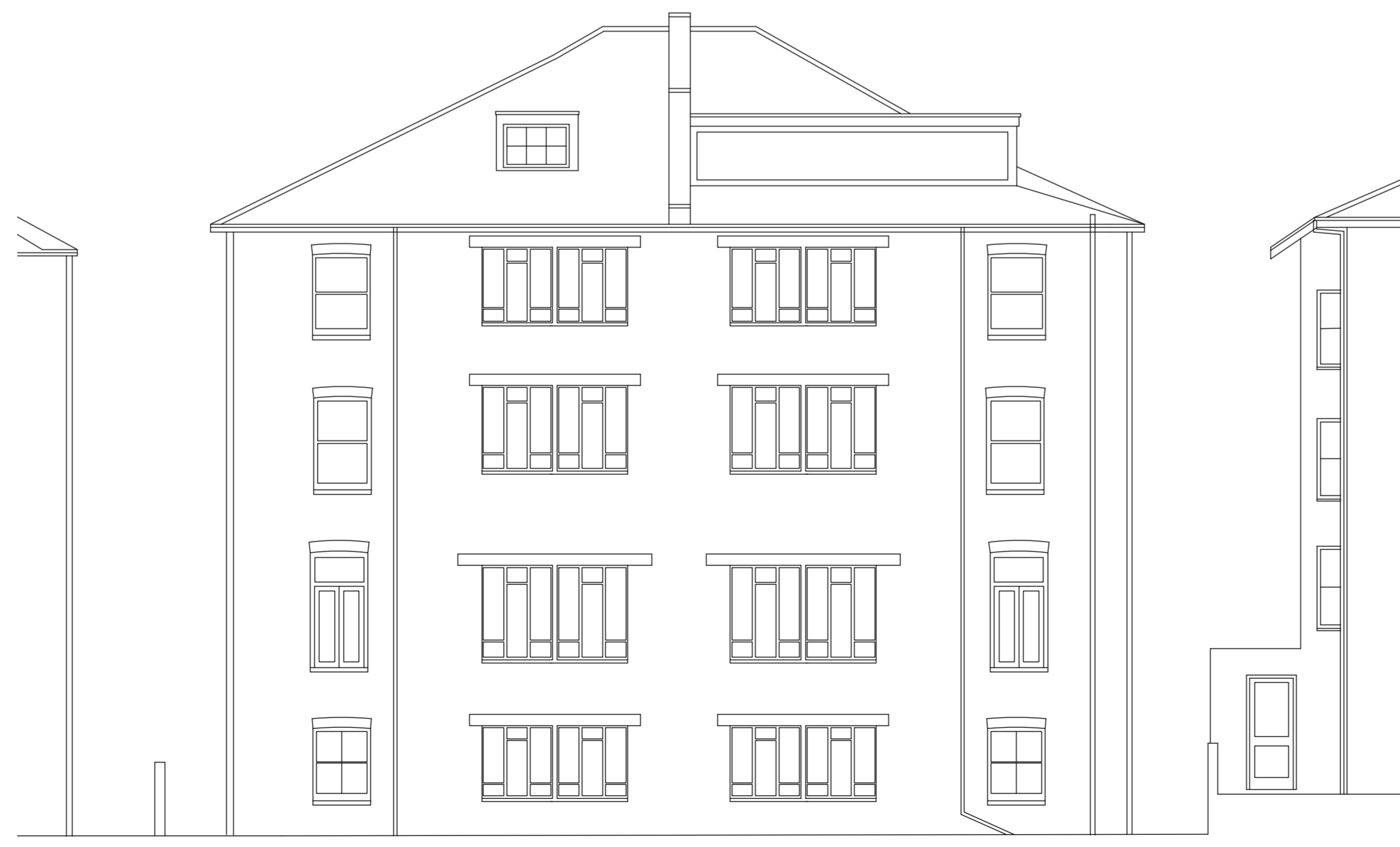
03 EXISTING NORTH-EAST ELEVATION (NE) SCALE 1:100