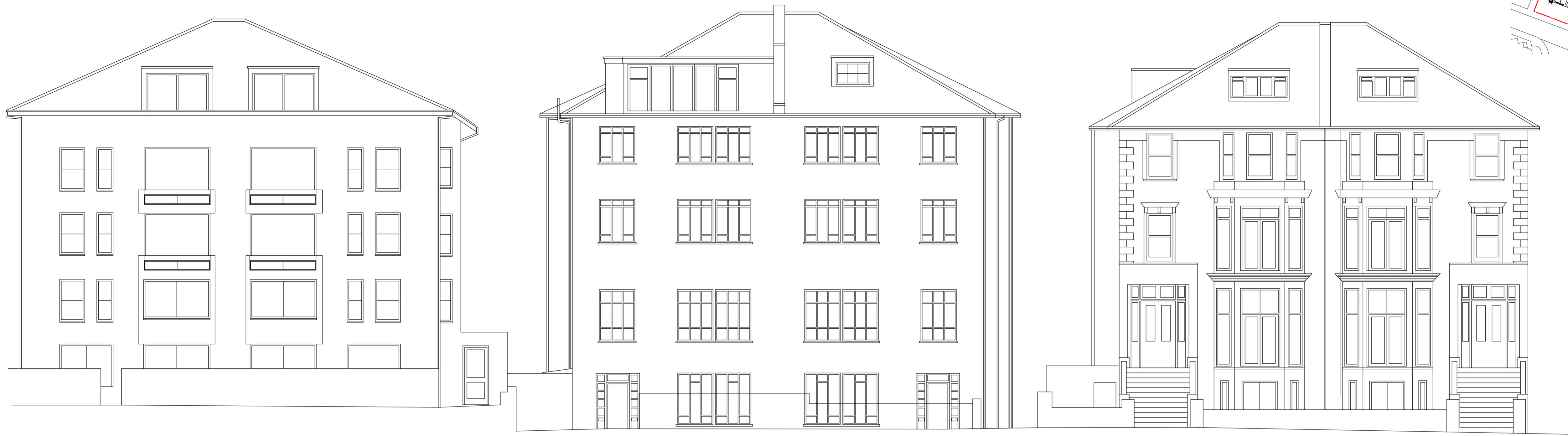
01 EXISTING SOUTH-WEST ELEVATION (SW) SCALE 1:100

© john pardey architects • Do not Scale. Used figured dimensions only. • All dimensions to be checked on site. • All drawings to be read in conjunction with engineer's drawings. Any discrepancies between contractor's drawings to be reported to the Architect before any work commences. • The Contractor's attention is drawn to the Health & Safety matters identified in the Health & Safety plan and on drawings as being potentially hazardous. • These items should not be considered as a full and final list. • The Work Package Contractor's normal Health & Safety obligations still apply when undertaking constructional operations both on and off site.