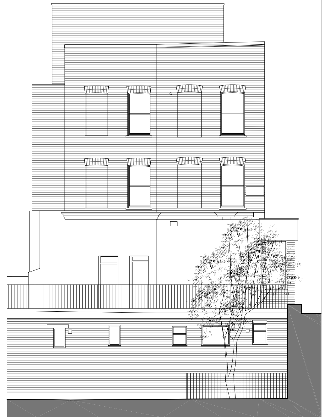
01 Elevation 1 - Royal College St.